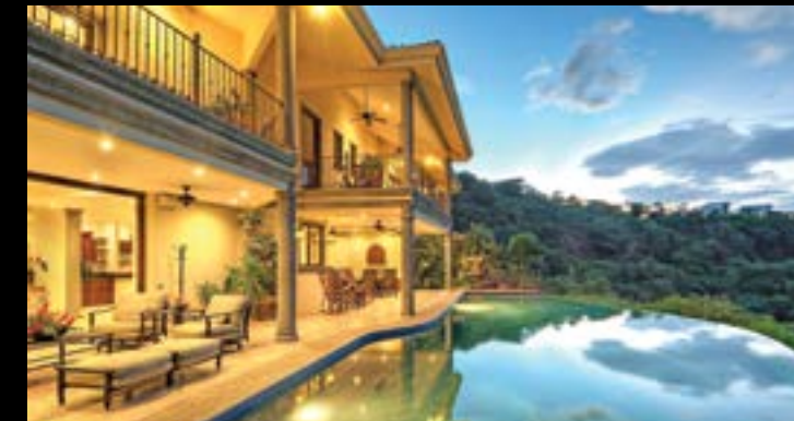
Costa Rica 7 Beds, 12,000sqft $3,800,000