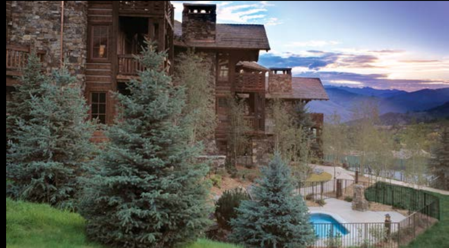
SETTLERS LODGE #203

Enjoy ski slope views from this sunny, south-facing 1,786 sqft condo in the heart of Bachelor Gulch. 3 bed & 3.5 baths complement the great room which boasts hardwood floors & a stone fireplace. A large deck overlooks the park & the ski runs, affording you great views, afternoon sun & gorgeous sunsets! A hot tub, underground parking garage, large ski storage room with locker & elevator access to the condo. $1,395,000 furnished.