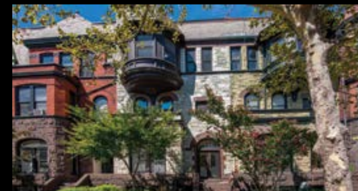
Washington DC 4 Beds, 6 Baths $2,895,000