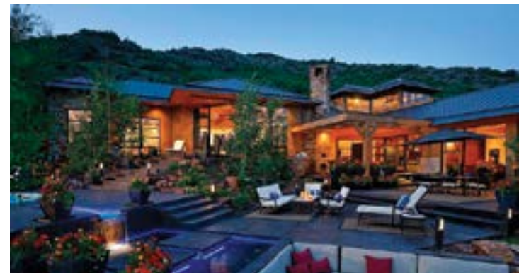
Aspen, Colorado 7 Beds, 13,167sqft $16,900,000