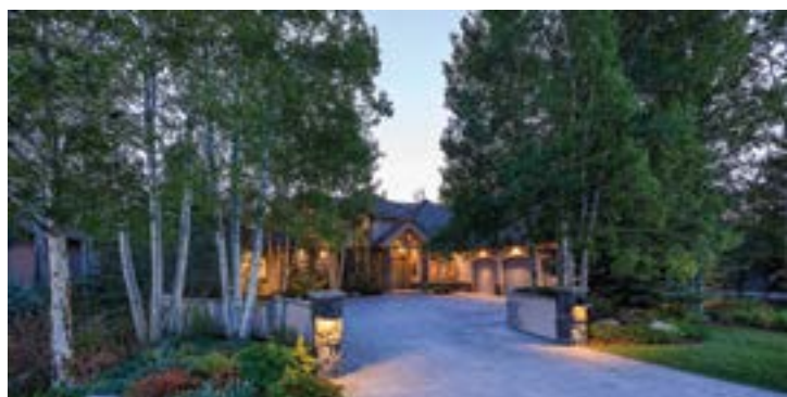
Arrowhead 6 Beds, 7,080sqft $3,700,000 Listed by Gateway