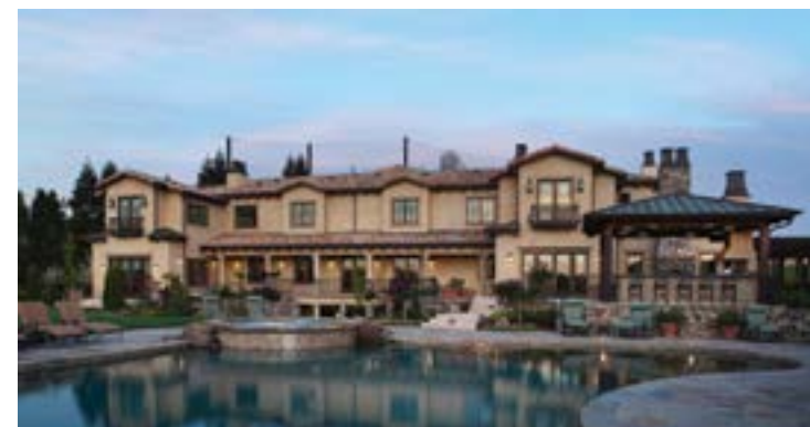
Danville, California 10 Beds, 18,932sqft $15,000,000