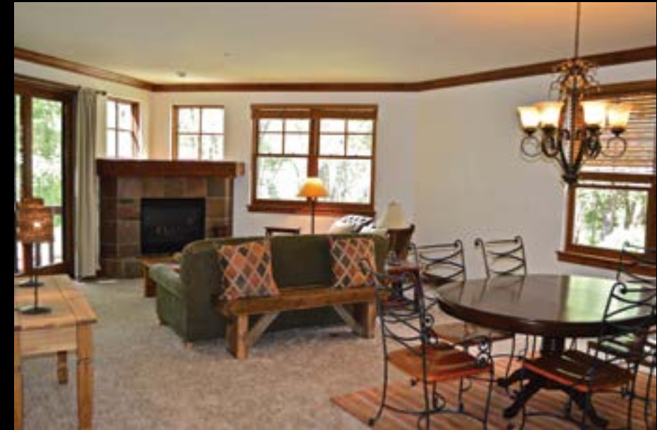
BROOKSIDE PARK #201 AVON

Enjoy views & sounds of the Eagle River from the living room & every bedroom in this beautiful 3 bedroom, 3 bath, 2,000 sqft town home. The newly remodeled residence features quality finishes, generous bedroom suites, 2 balconies, a ground level patio, attached 1-car garage & ample storage. Step out your front door to ride your bike along the Eagle River bike path or to fly fish in the summer, or take the free ski shuttle to Beaver Creek Mountain in the winter. Very little Highway 6 impact & includes the use of the exercise facility, hot tub & pool. $820,000