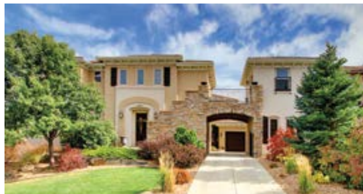
Denver, Colorado 5 Beds, 5,308sqft $1,350,000