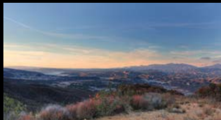
Santa Barbara, California 5 Beds, 3 Baths $4,995,000