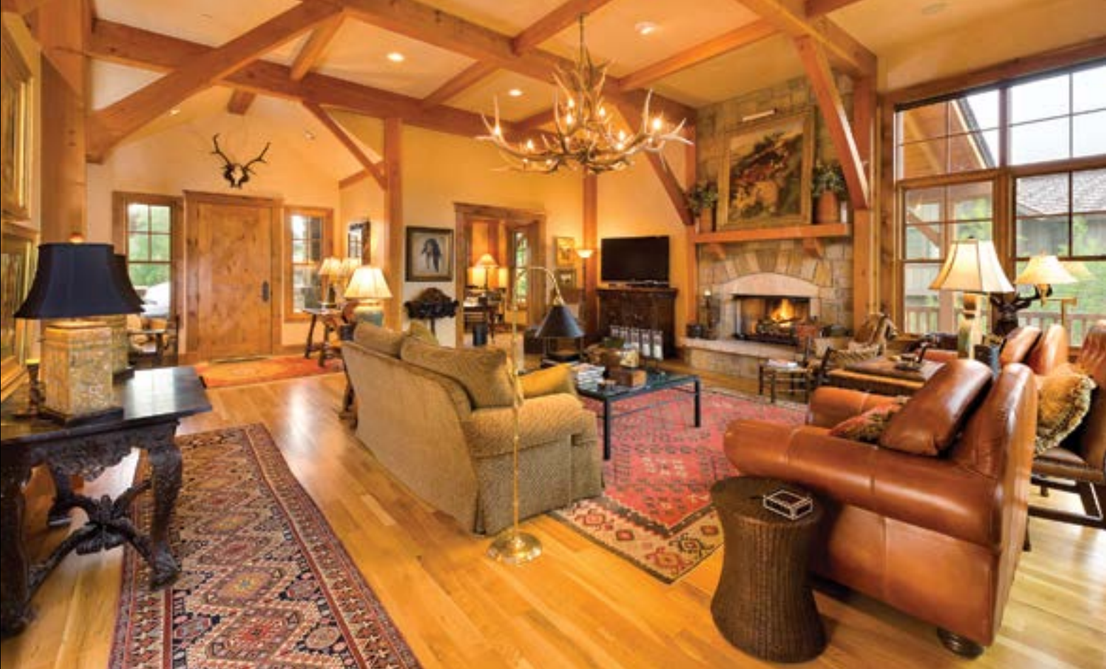
150 GREYHAWK LANE THE RANCH AT CORDILLERA

This stunning home in The Ranch at Cordillera offers beautiful, sweeping vistas. Located just a short two minutes from the gate, this single family residence has main level living with the spacious master and cozy study, both on the first level. A gracious living room boasts vaulted ceilings and spectacular stone fireplace and the gourmet kitchen is contiguous to the large dining room and an expansive deck. The large recreation room opens to stone terrace with hot tub while four additional bedroom suites complete the home. $1,950,000