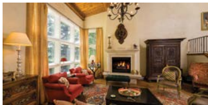
Vail 3 Beds, 2,726sqft $1,400,000 Listed by Gateway