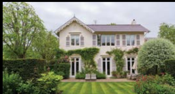
London, England 4 Beds, 4,012sqft £13,950,000