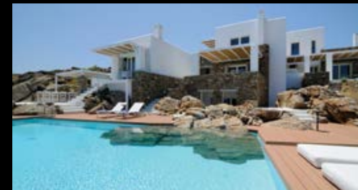
Mykonos, Greece 9 Beds, 7 Baths €5,500,000