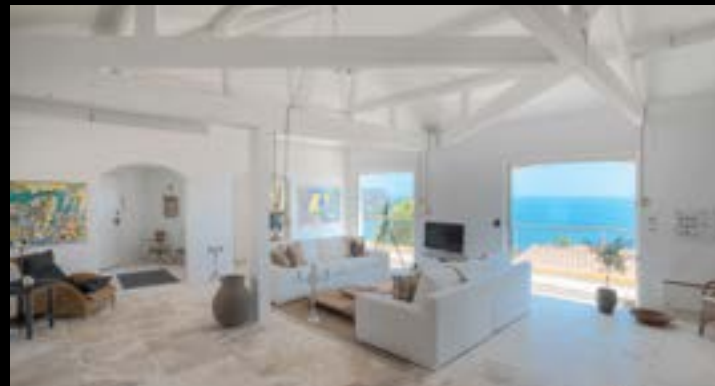
Cannes, France 3 Beds, 3 Baths €1,995,000