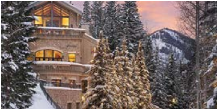
Vail 6 Beds, 11,771sqft $14,500,000 Sold by Gateway