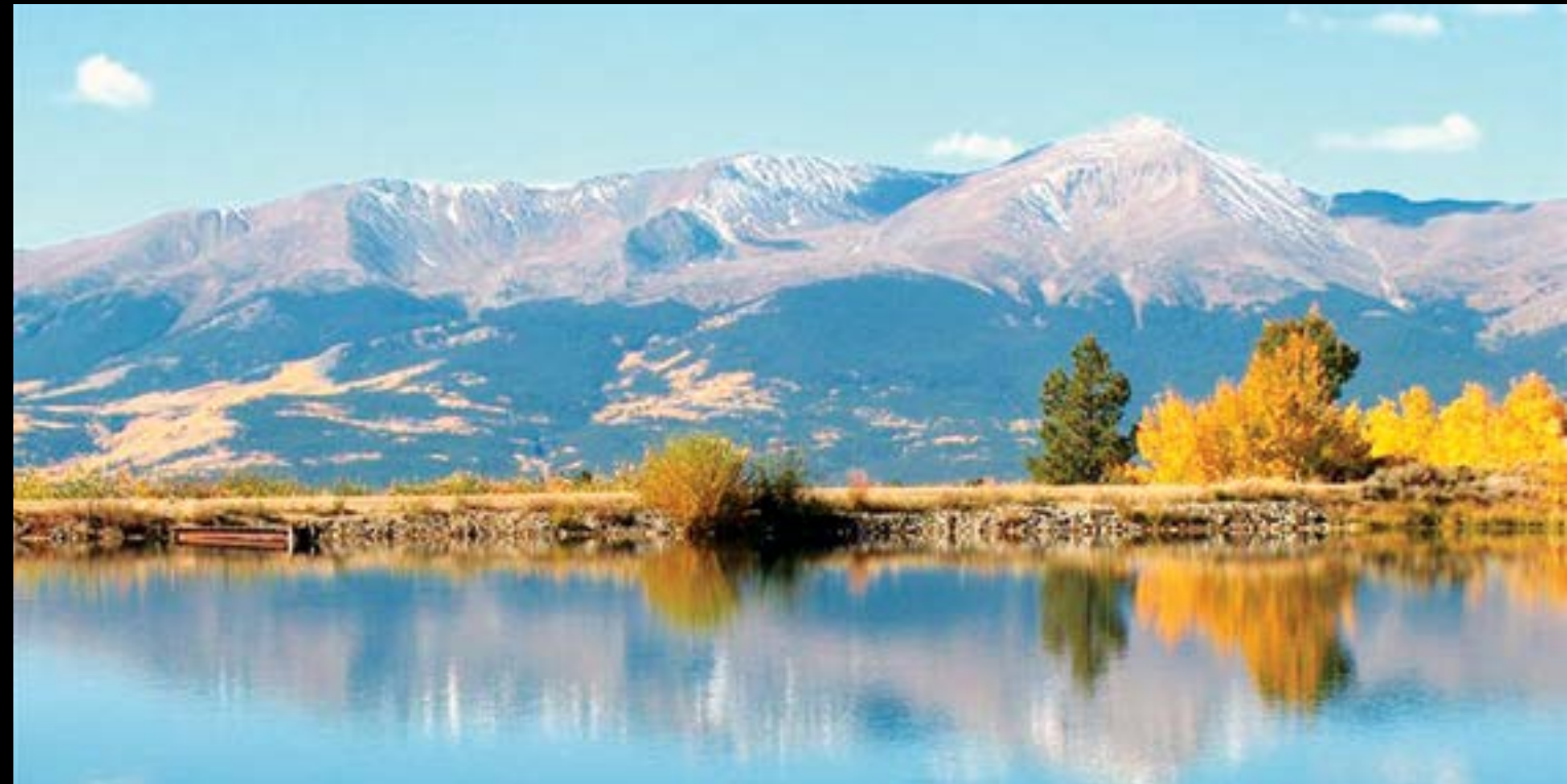
BEAVER LAKE ESTATE LEADVILLE

Beaver Lake Estate boasts private, buildable lots that are filled with Aspens & Pines with incredible views in every direction. Amenities include: community ponds, rental cabins, a horse corral & a clubhouse. Two private fishing lakes & RV hook-ups & campsites are conveniently close; a true rural, pristine escape unlike any other.