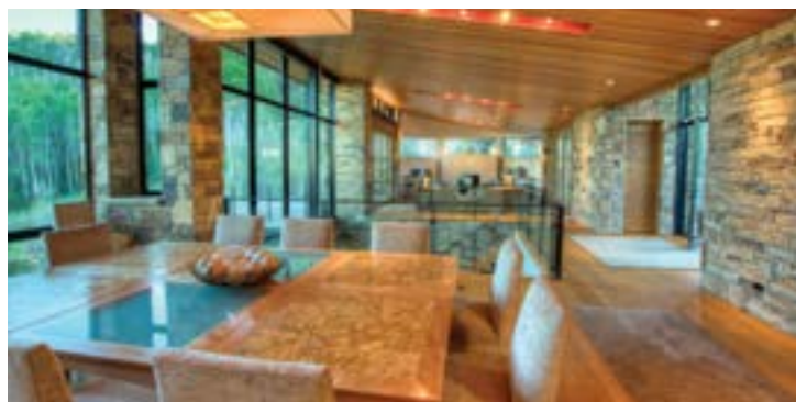
Lake Creek 5 Beds, 12,521sqft $9,500,000 Sold & Listed by Gateway

Select Properties Recently Sold by Gateway Land & Development Real Estate