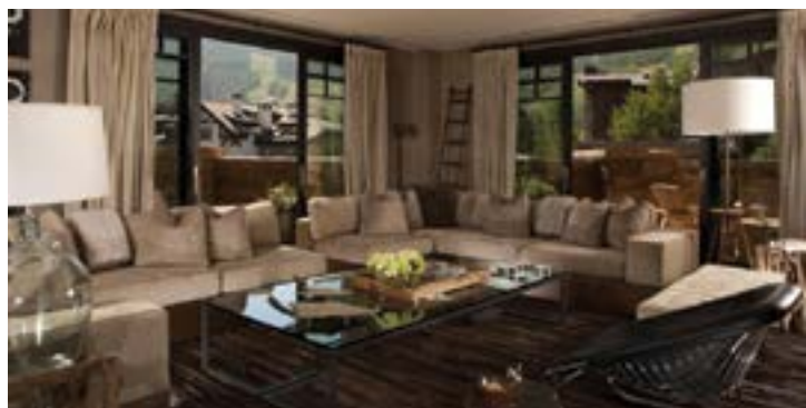
Vail 4 Beds, 2,795sqft $8,125,000 Sold by Gateway