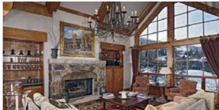
Vail 4 Bedroom, 3,787sqft $8,300,000 Sold by Gateway