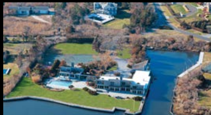
Hamptons, New York 6 Beds, 5,000sqft $5,999,000