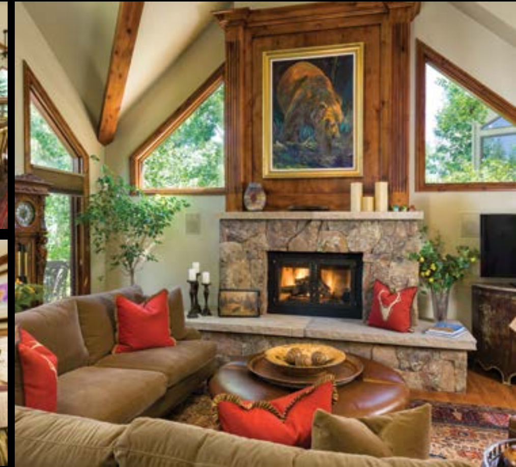
580 EAST ARROWHEAD DRIVE PINONS

This completely remodeled, highly desirable 5 bed, 5.5 bath, 3,804 sqft duplex features soaring cathedral ceilings & huge banks of windows that frame grand views of the 2nd & 3rd fairways of Country Club of the Rockies golf course. The main floor of the gracious 5 bedroom home offers a large great room, stunning kitchen & spacious master with his & her closets. A south facing, private stone patio with fireplace overlooks private gardens & open space. $1,895,000