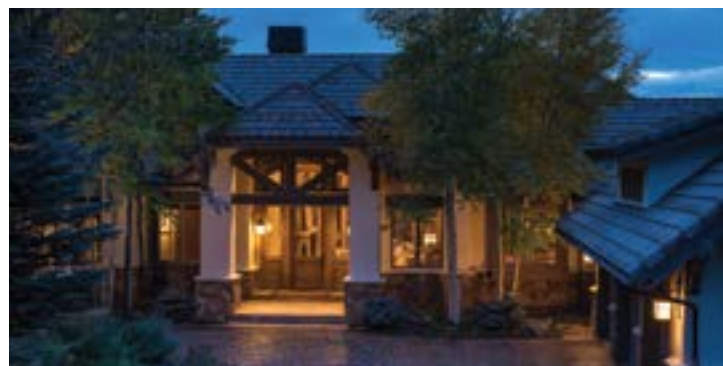
Cordillera Divide 5 Beds, 7,413sqft $3,850,000 Listed by Gateway