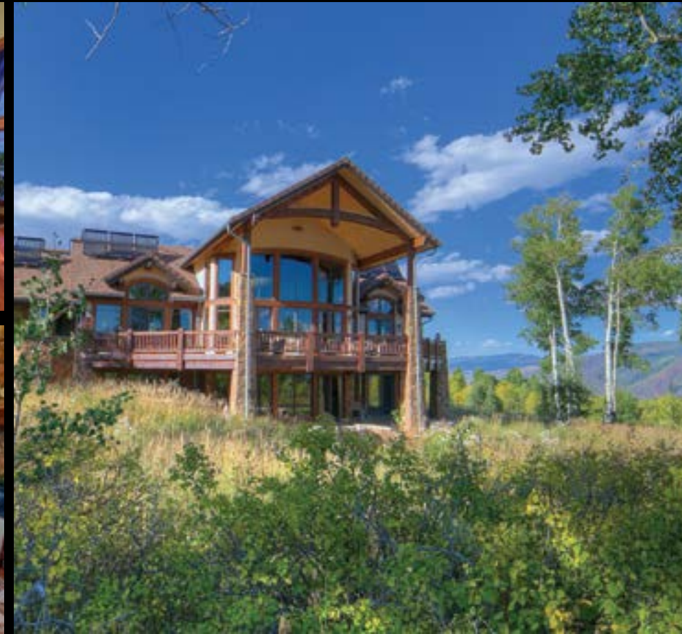
5458 BELLYACHE RIDGE ROAD BELLYACHE RIDGE

This 7,333 square foot estate is situated on an aspen-laden 2.53 acre homesite and is contiguous to over 20 acres of Open Space. Dramatic floor-to-ceiling windows capture unmatched, sweeping views from the Gore Range to the Sawatch mountain Range. This 6 bedroom stunner offers the highest quality finishes including scraped oak and Travertine floors, imported appliances, massive wood beams, stone fireplaces, and European clay tile roof. Outdoor stone patios and fire pit surround the home and offer an incredible setting for entertaining. Separate caretakers/mother-in-law suite, expanded garages, and solar energy complete this home. $2,850,000