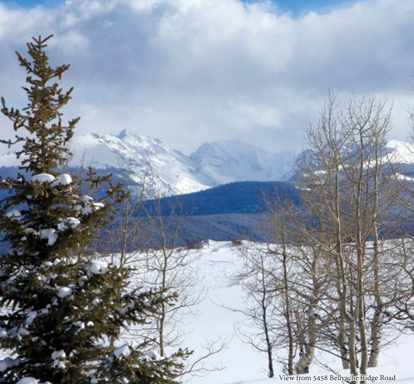
View from 5458 Bellyache Ridge Road