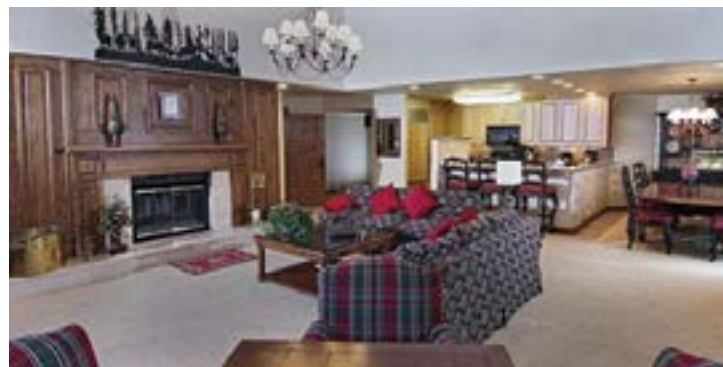
Vail 4 Bedroom, 1,945sqft $3,150,000 Sold by Gateway