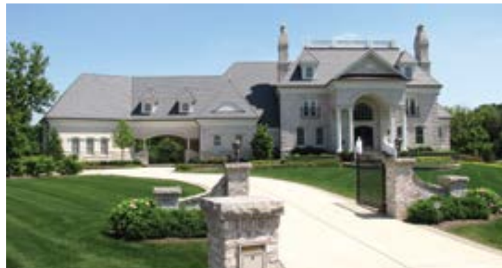
Chicago, Illinois 7 Beds, 8,176sqft $3,746,000