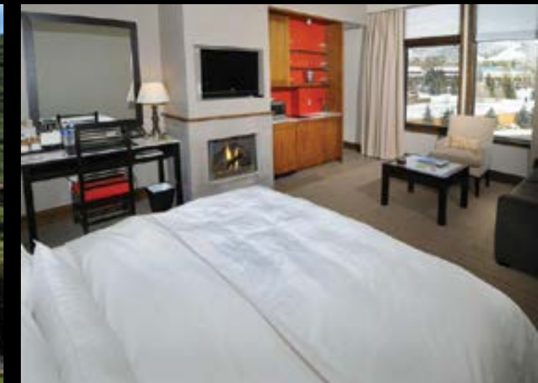
BENCHMARK ROAD #A6 AVON