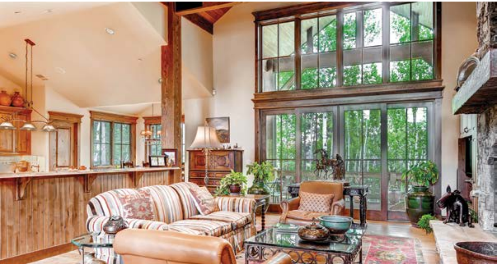
2486 FENNO DRIVE THE RANCH

This stunning 6458 sqft home overlooks the 3rd tee box of the renowned Hale Irwin designed course. With beautiful finishes & a free flowing floor plan, the residence offers an expansive great room with floor to ceiling stone fireplace, beautiful gourmet kitchen with Viking appliances & slab marble counters. The main level master has vaulted ceilings & a spacious spa bath while a lovely caretakers suite is located over the 3 car garage. The walk-out lower level has 3 bedroom suites, wet bar & media room! $2,200,000