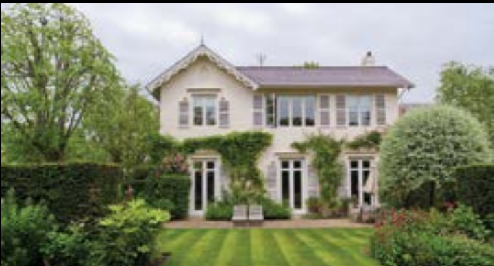
London, England 4 Beds, 4,012sqft £13,950,000