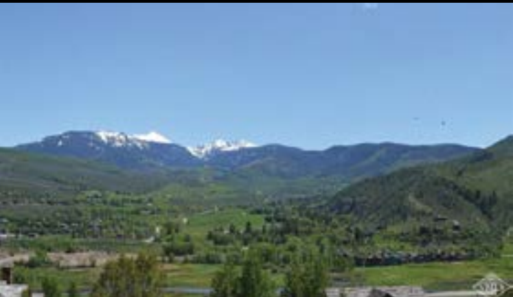
161 LEGACY TRAIL THE RANCH

Awe-inspiring views of the Gore Range & Teapot Mountain abound from this 6.45-acre site. Private & quiet, this is the perfect lot for your Colorado dream home! Soils & perk tests completed & complete building plans available for purchase. $275,000