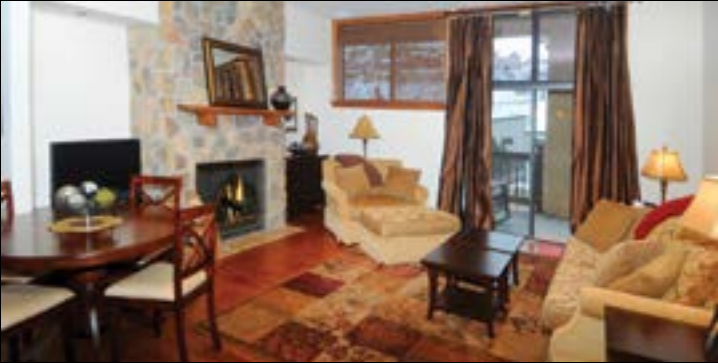
Edwards 2 Bedroom, 1,545sqft $553,000 Listed & Sold by Gateway