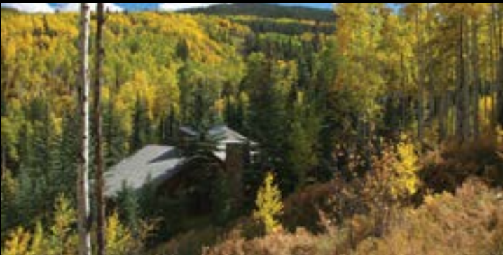
Beaver Creek 5 Beds, 3,315sqft $3,250,000 Listed by Gateway