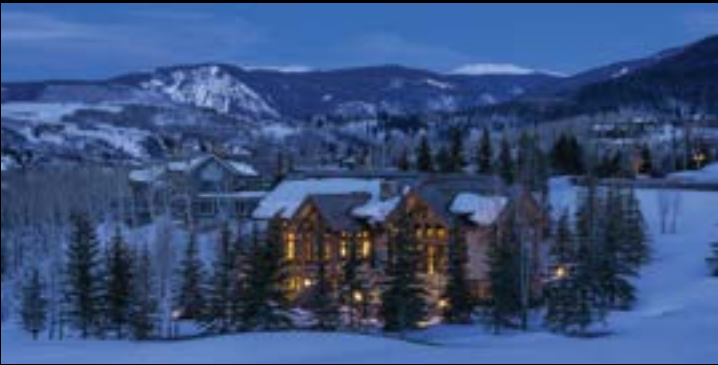
Cordillera Ranch 5 Beds, 5,361sqft $2,277,900 Sold & Listed by Gateway