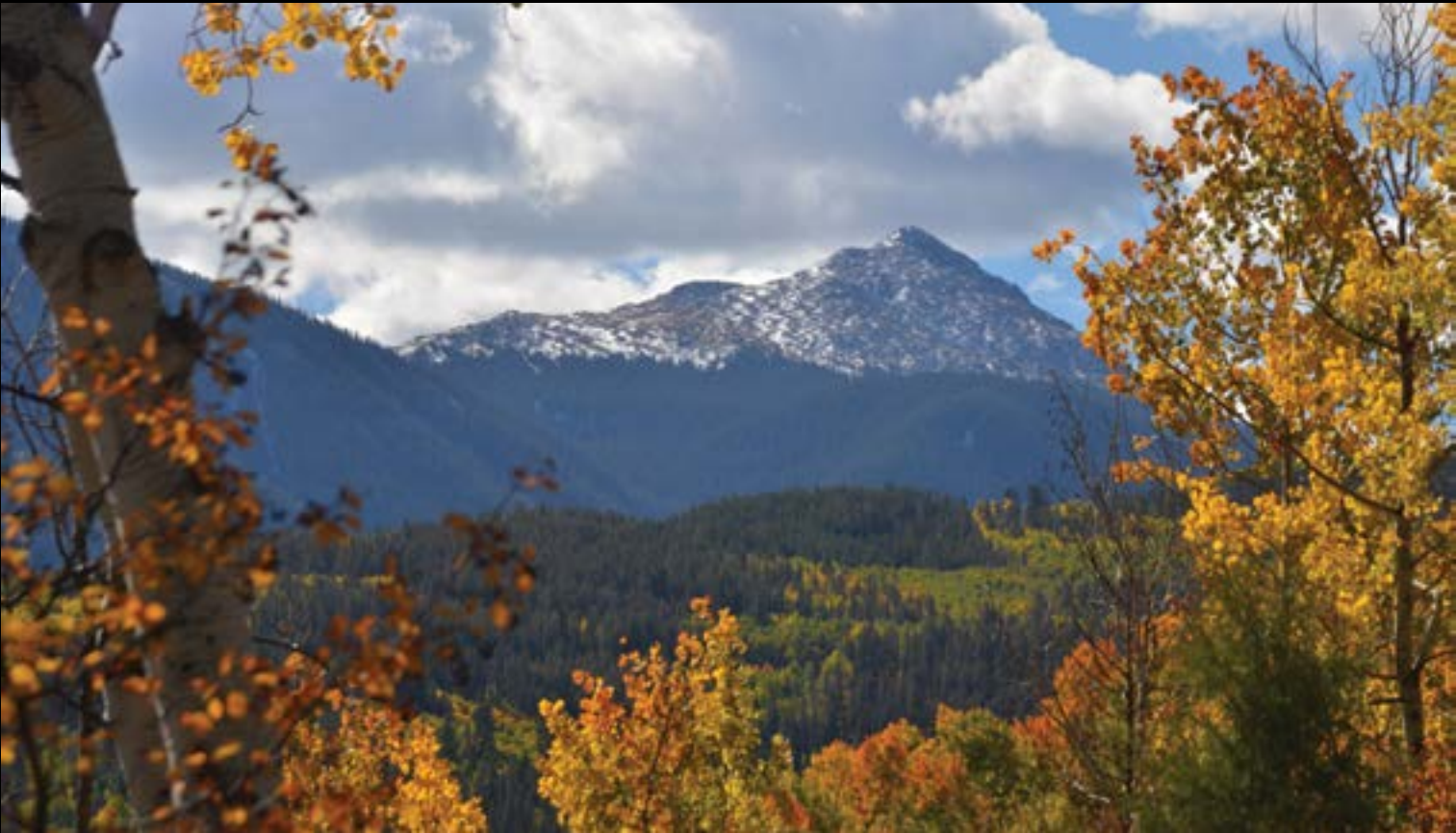
1937 WEST LAKE CREEK ROAD LAKE CREEK

This .31-acre home site is one of Homestead's finest lots. With great privacy, set at the end of a cul-de-sac, this beautiful site has unobstructed 360-degree views of Colorado mountains. Easily buildable this lot is sunny, flat, & gently perched above surrounding homes. Enjoy the newly renovated Homestead Court Club. Just five minutes to downtown Edwards Reduced to $379,000