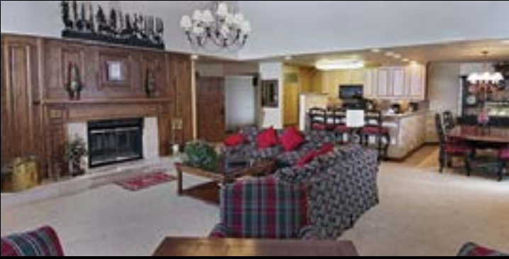
Vail 4 Bedroom, 1,945sqft $3,150,000 Sold by Gateway