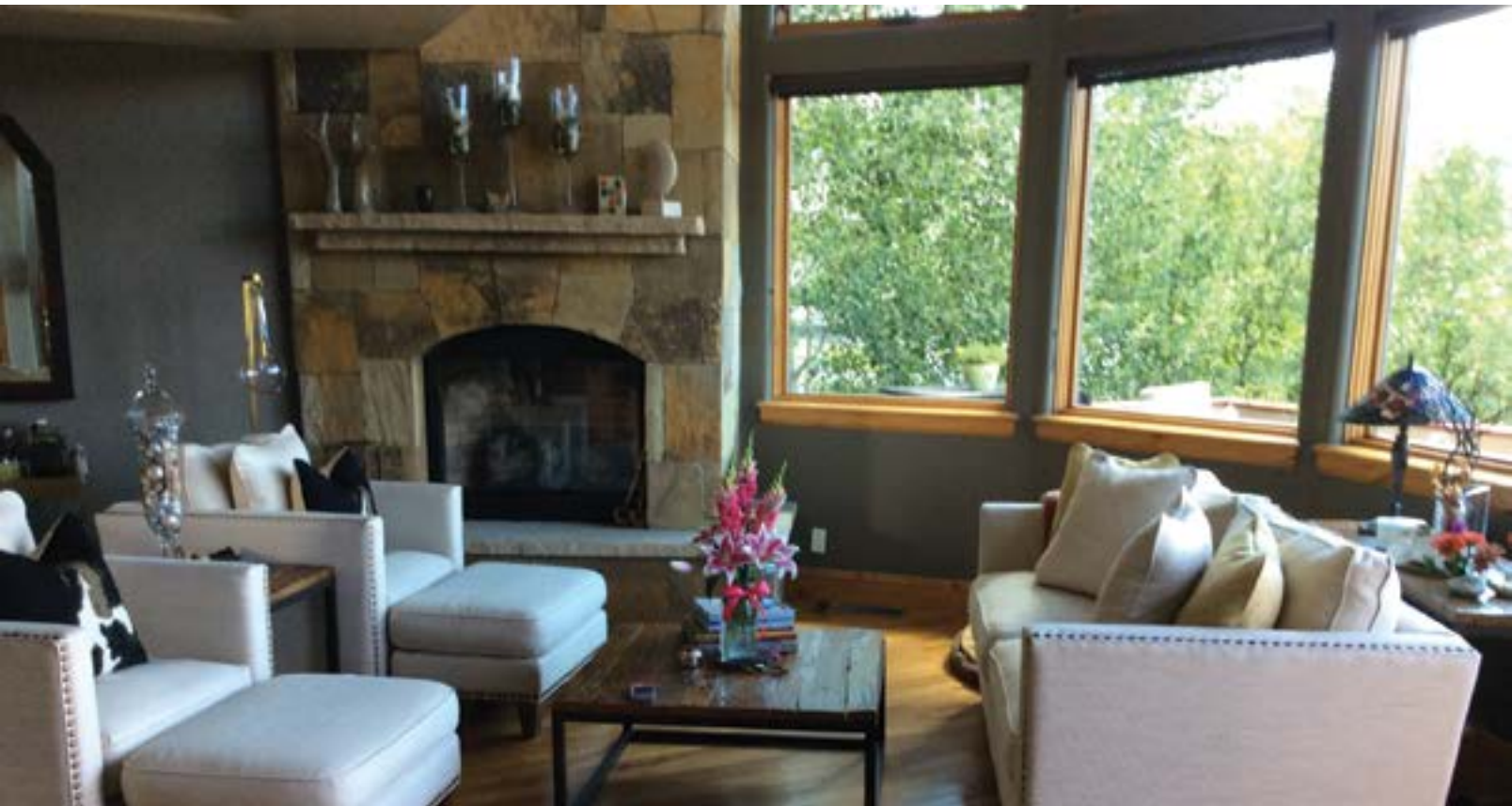
LAS VISTAS #26 SINGLETREE

Beautiful 2,516 sqft townhome offers 3 bedrooms & 3.5 bathrooms, an office, a large deck & an oversized attached garage. High-end finishes include hardwood floors, stone fireplace, soaring windows & granite counters. Please call for pricing.