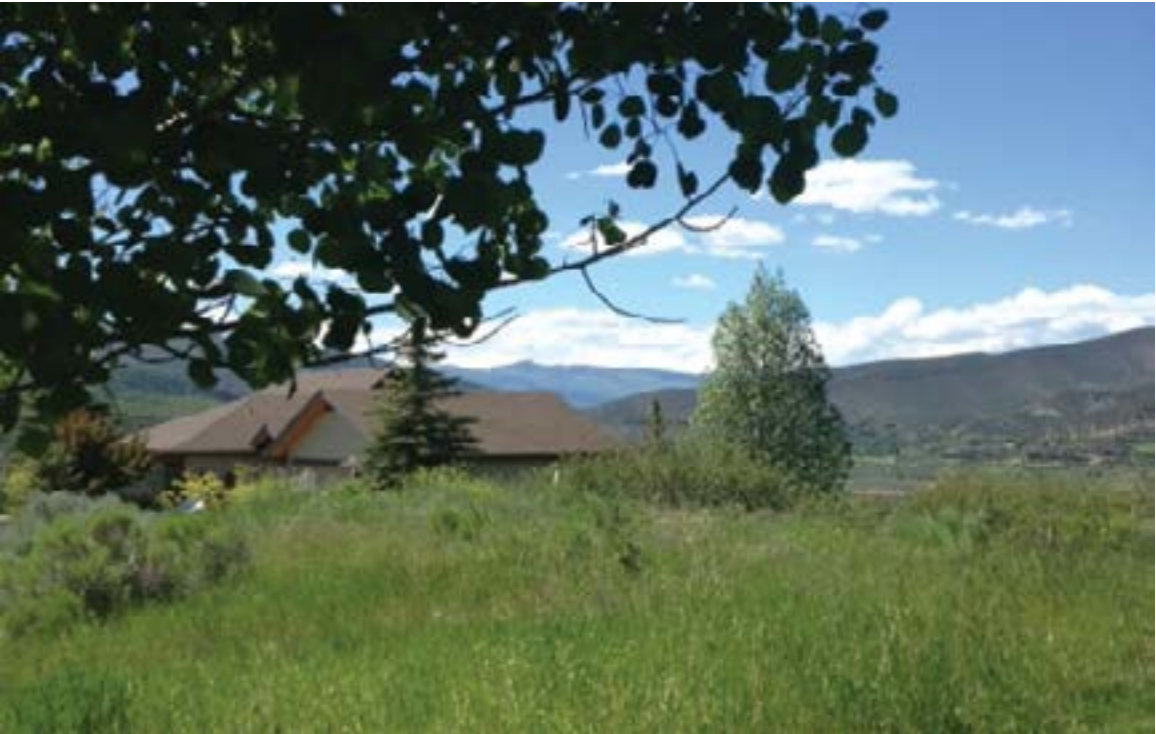
1077 GOLD DUST DRIVE HOMESTEAD

Beautiful 2,516 sqft townhome offers 3 bedrooms & 3.5 bathrooms, an office, a large deck & an oversized attached garage. High-end finishes include hardwood floors, stone fireplace, soaring windows & granite counters. Please call for pricing.