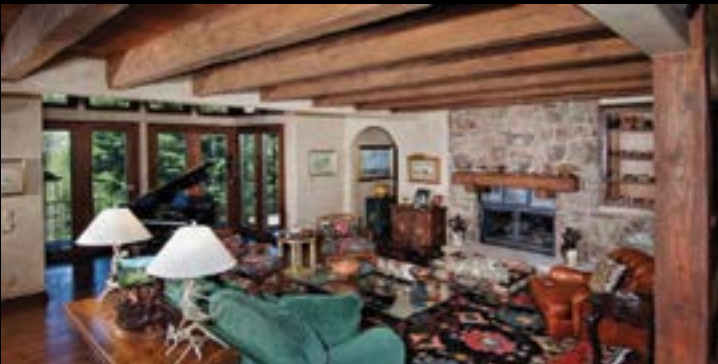
Arrowhead 4 Beds, 5,148sqft $2,350,000 Sold by Gateway

Select Properties Recently Sold by Gateway Land & Development Real Estate