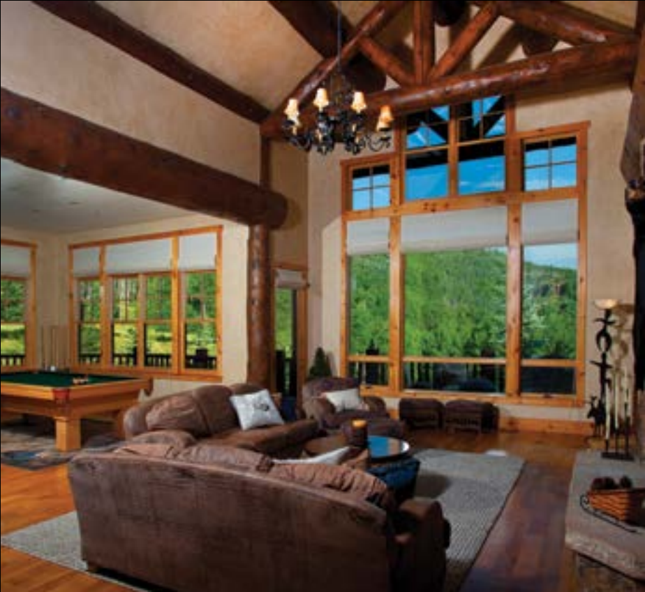
166 CIMARRON TRAIL THE RANCH

Just minutes from the gate & clubhouse in the highly desirable Cimarron neighborhood, this 5 bedroom, 4,745 sqft beauty offers an exceptional floorplan with spacious main level master & study. Soaring wrap-around windows capture gorgeous views across the fairways to Castle Peak. The gourmet kitchen with slab granite & top-of-the-line appliances opens to a cozy nook. The outdoor living is without peer & includes expansive decks, private patios & mature landscaped gardens. $1,795,000