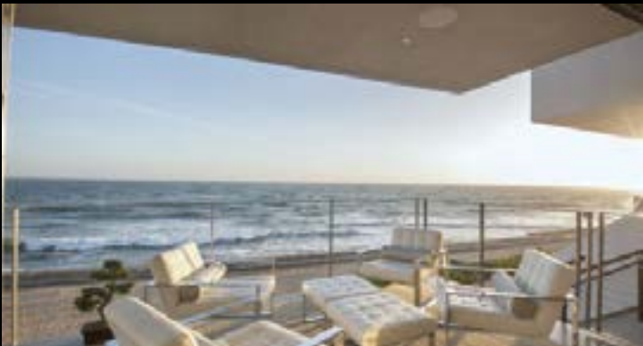
Malibu, California 3 Beds, 2.5 Baths $3,100,000