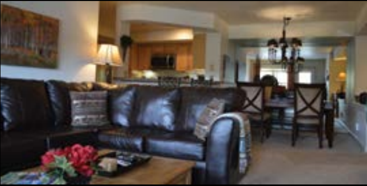
Edwards 3 Beds, 1,314sqft $449,000 Listed by Gateway