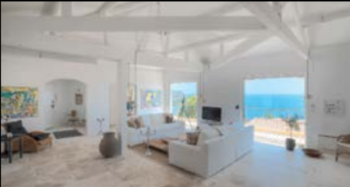
Cannes, France 3 Beds, 3 Baths €1,995,000