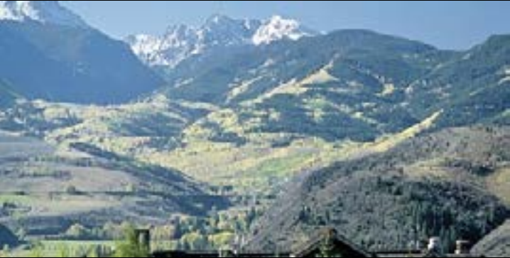
Cordillera Valley 6 Beds, 5,193sqft $2,300,000 Listed by Gateway