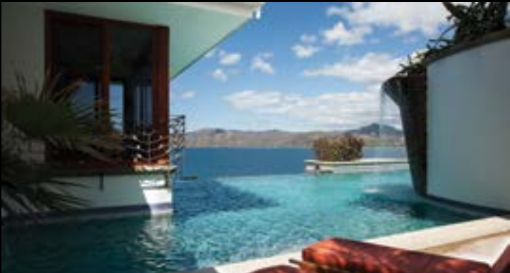
Costa Rica 5 Beds, 2.5 acres $5,500,000