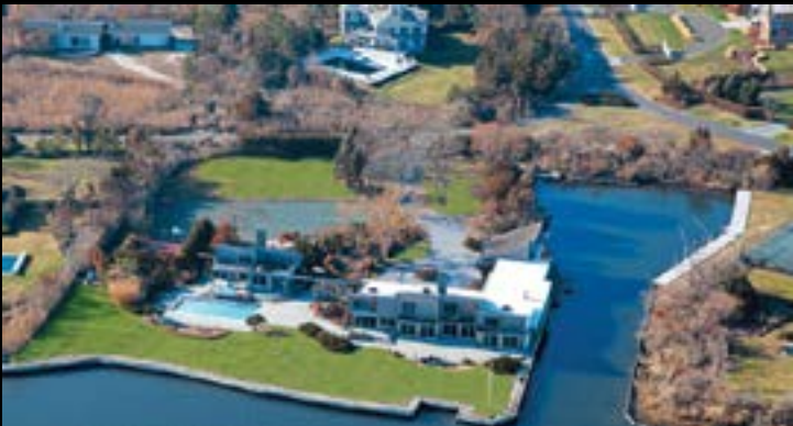
Hamptons, New York 6 Beds, 5,000sqft $5,999,000