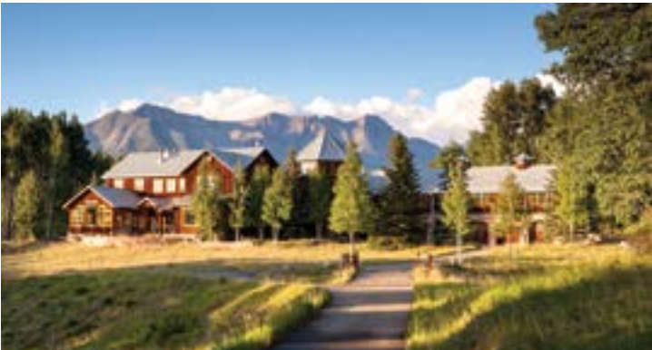
Telluride, Colorado 13 Beds, 28 acres $17,900,000