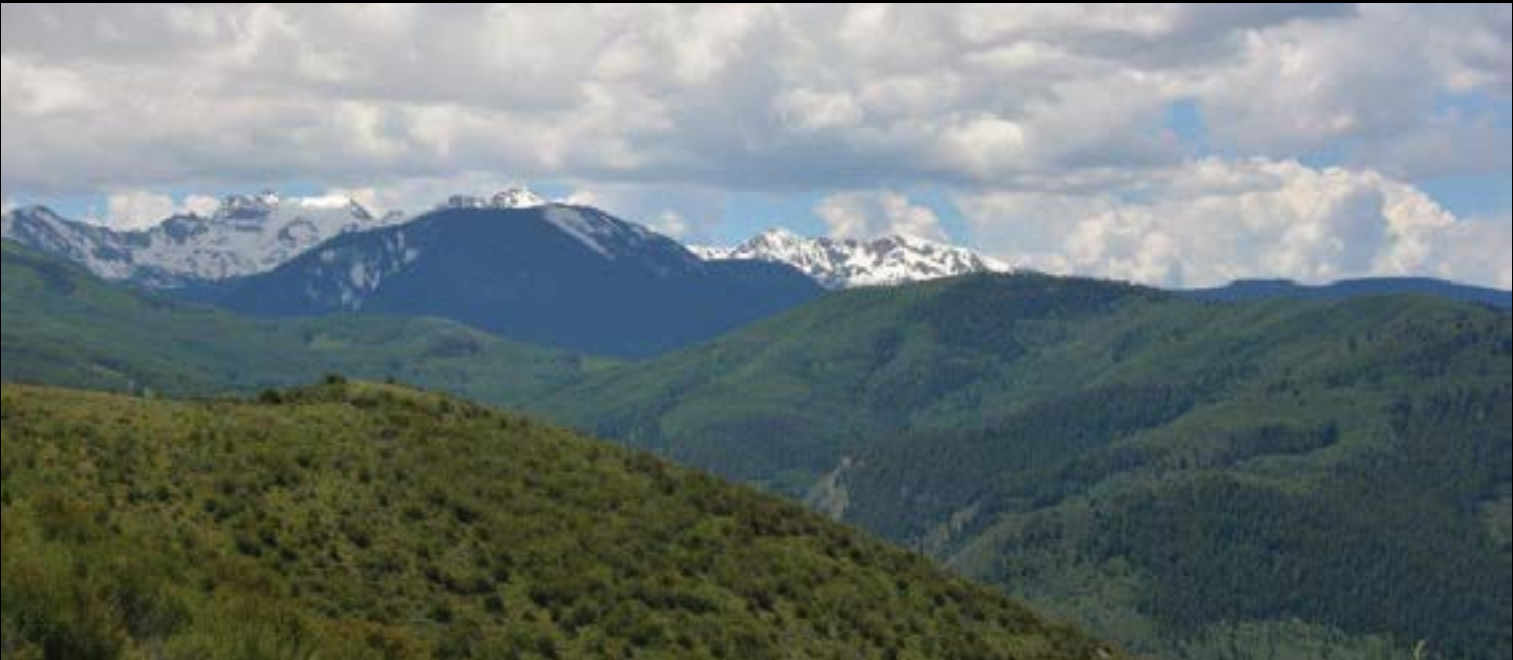
2957 JUNE CREEK TRAIL WILDRIDGE, AVON

A beautiful 1.2 acre duplex homesite in Wildridge. There are few lots left in the entire Vail Valley like this one! Set against BLM land, this site feels much larger than it really is. Located steps from a pocket park & across the street from June Creek forest access road, this is a prime lot just minutes to Avon, Beaver Creek, & Vail. $395,000