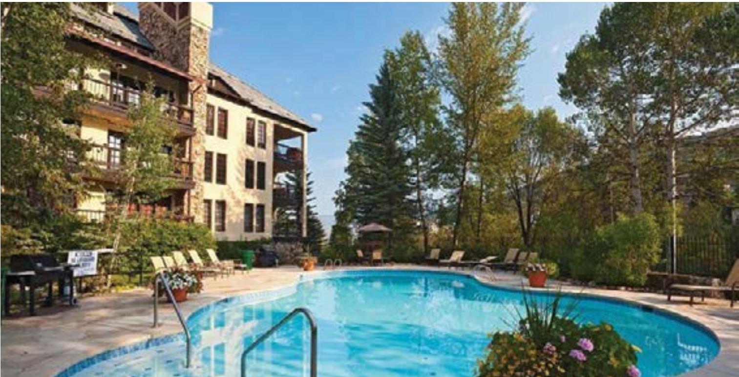
CREEKSIDE #B309 BEAVER CREEK

Set in the heart of Beaver Creek Village, this great ski-in/ski-out condominium home has wonderful personality & the coveted atrium location. With 2 bedrooms & 3 full bathrooms, this 1,413 sqft residence boasts new tile floors, wood accented ceilings, a wet bar & built-in bookcase & shelves. The Creekside building offers amenities that include a pool, hot tubs & fitness room. This residence has incredible rental potential as well! $785,000