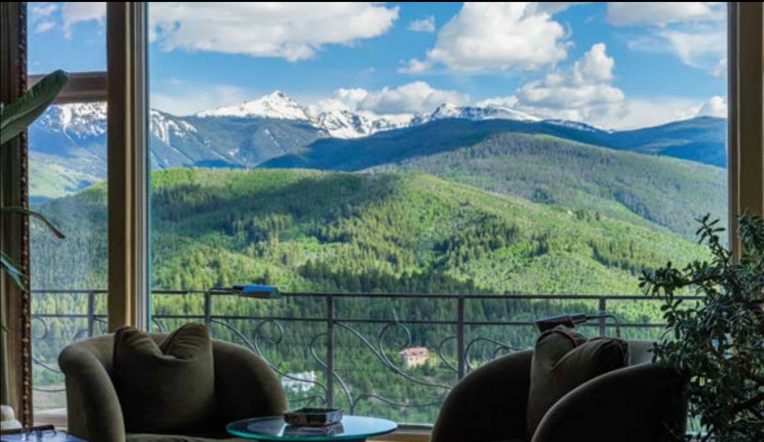
115 ALHAMBRA PLACE THE DIVIDE AT CORDILLERA

This stunning home offers beautiful, sweeping vistas. Located just 2 minutes from the gate, this residence has main level living with the spacious master & cozy study, both on the first level. A gracious living room boasts vaulted ceilings & spectacular stone fireplace & the gourmet kitchen is contiguous to the large dining room & an expansive deck. The large recreation room opens to a stone terrace with hot tub while 4 additional bedroom suites complete the home. $1,795,000