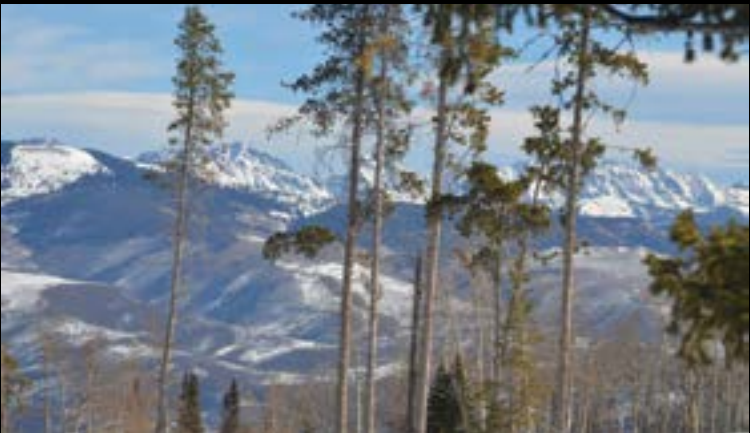
355 GRANITE SPRINGS THE RANCH

Just minutes from the gate & clubhouse in the highly desirable Cimarron neighborhood, this 5 bedroom, 4,745 sqft beauty offers an exceptional floorplan with spacious main level master & study. Soaring wrap-around windows capture gorgeous views across the fairways to Castle Peak. The gourmet kitchen with slab granite & top-of-the-line appliances opens to a cozy nook. The outdoor living is without peer & includes expansive decks, private patios & mature landscaped gardens. $1,795,000