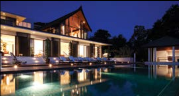
Thailand 5 Beds, 6 Baths $8,500,000