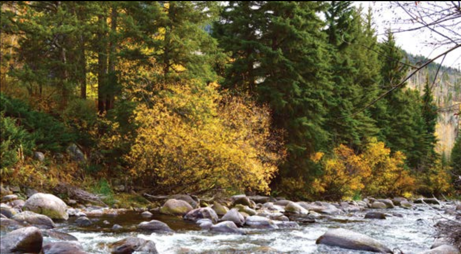
1763 SHASTA PLACE CASCADE VILLAGE

Enjoy the convenience of heated & secure parking on the main floor of the Founder’s Garage. Only steps from the entrance, ski slopes & Vail Village restaurants & shops. Easy in & out with no ramps. The ultimate convenience for you & protection of your auto, all in the heart of the Village. Offered for $300,000