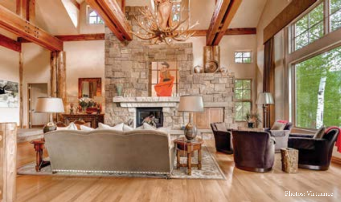
219 ASPEN MEADOWS ROAD THE RANCH

This stunning 6458 sqft home overlooks the 3rd tee box of the renowned Hale Irwin designed course. With beautiful finishes & a free flowing floor plan, the residence offers an expansive great room with floor to ceiling stone fireplace, beautiful gourmet kitchen with Viking appliances & slab marble counters. The main level master has vaulted ceilings & a spacious spa bath while a lovely caretakers suite is located over the 3 car garage. The walk-out lower level has 3 bedroom suites, wet bar & media room! $2,200,000