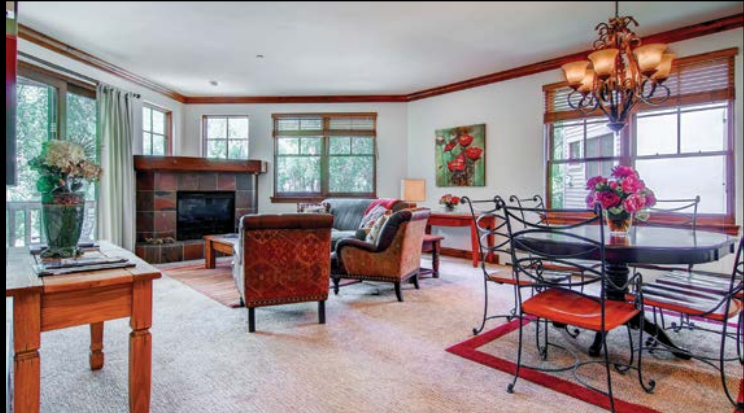
BROOKSIDE PARK #201 AVON

Enjoy views & sounds of the Eagle River from the living room & every bedroom in this beautiful 3 bedroom, 3 bath, 2,000 sqft town home. The newly remodeled residence features quality finishes, generous bedroom suites, 2 balconies, a ground level patio, attached 1-car garage & ample storage. Step out your front door to ride your bike along the Eagle River bike path or to fly fish in the summer, or take the free ski shuttle to Beaver Creek Mountain in the winter. Very little Highway 6 impact & includes the use of the exercise facility, hot tub & pool. $820,000