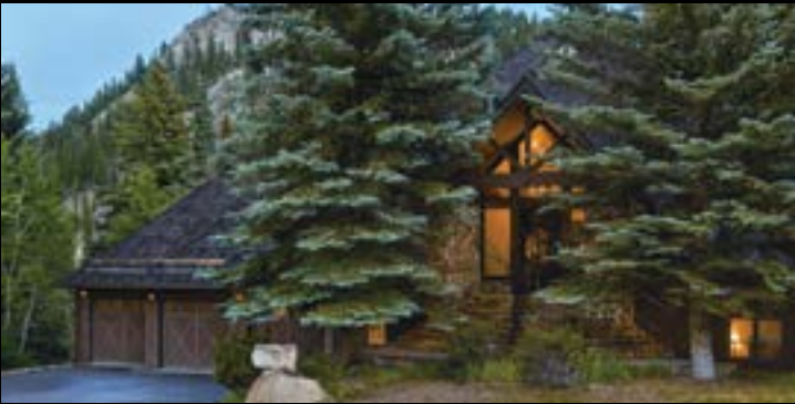
Beaver Creek 6 Beds, 7,289sqft $3,000,000 Listed by Gateway