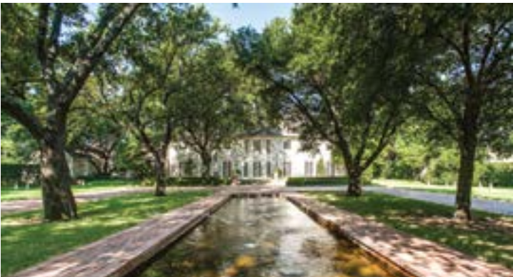
Dallas, Texas 7 Beds, 7.5Baths $6,295,000