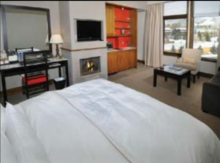
WESTIN RIVERFRONT #331 AVON

This studio bedroom, one bathroom condominium is in the heart of Avon & close to everything Avon has to offer. Nice kitchen & open floor plan. Amenities of Spa Anjali, 25-meter salt water pool, exercise facility & 3 infinity hot tubs. LEED certified & pet friendly. This home is also a wonderful opportunity to earn rental income! $329,000 furnished