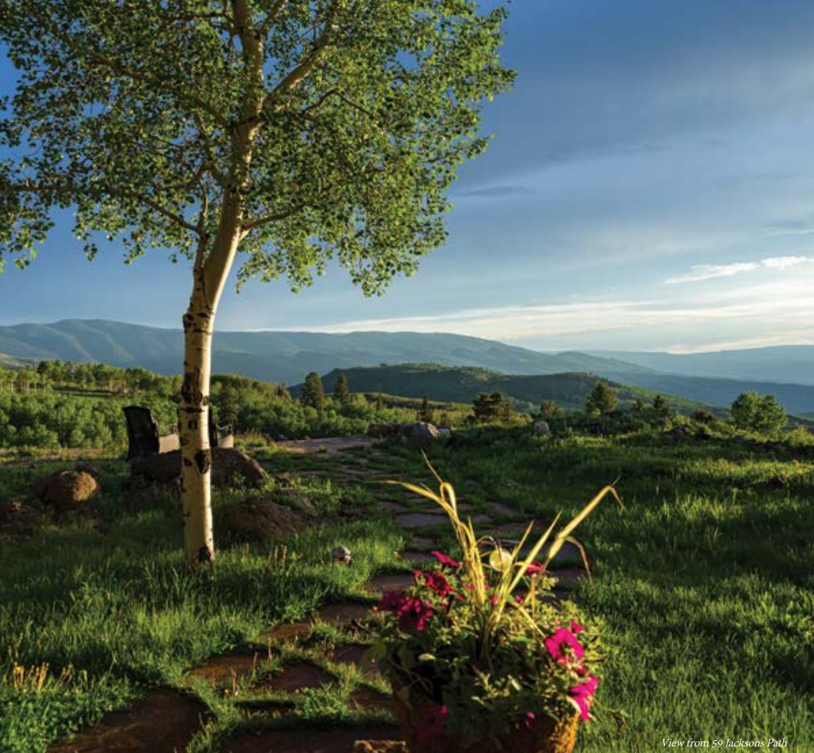
View from 59 Jacksons Path