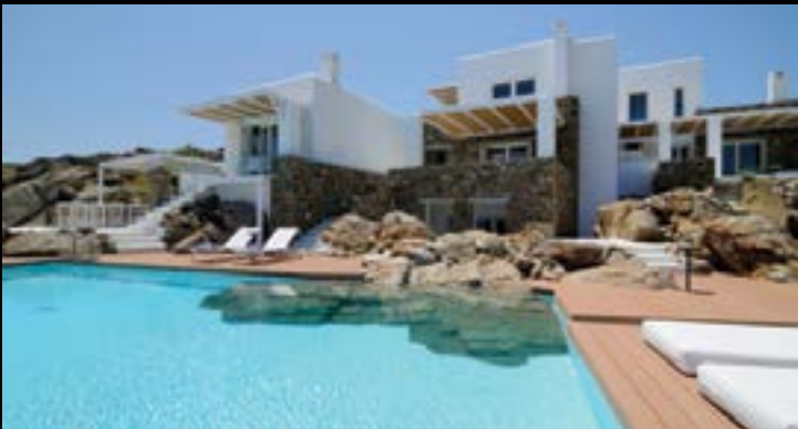
Mykonos, Greece 9 Beds, 7 Baths €5,500,000