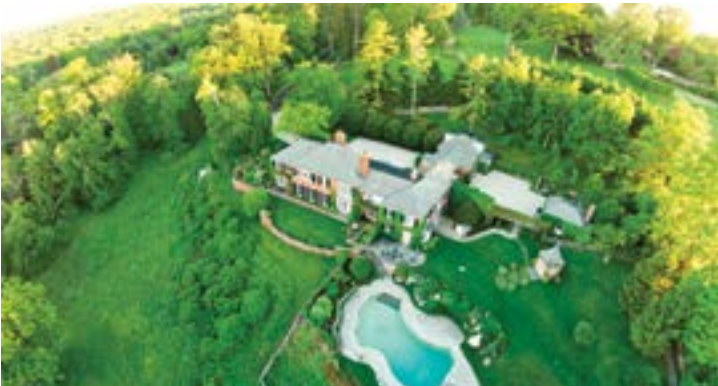
Greenwich, Connecticut 5 Beds, 8.21 acres $5,995,000