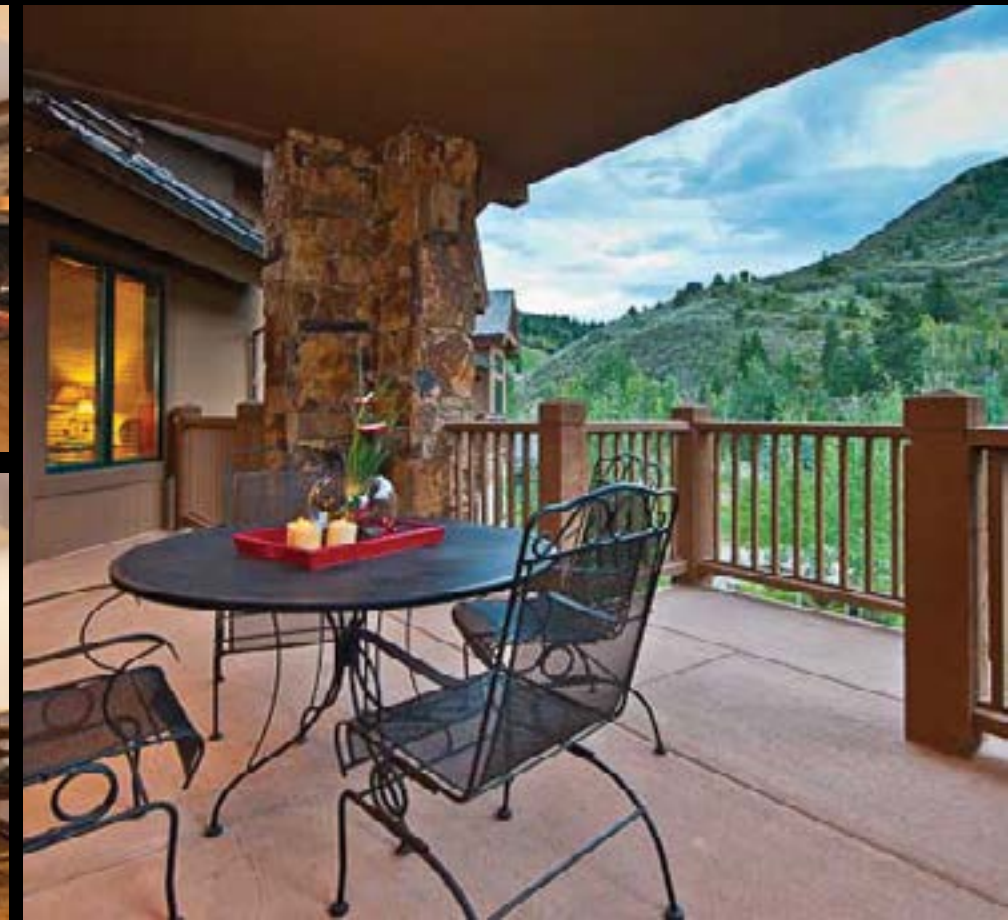
ONE ARROWHEAD PLACE #A403

Located in Arrowhead’s premier building, this ski-in/out 2 bedroom, 2.5 bathroom condominium boasts 1,474 square feet overlooking Arrowhead ski mountain. Features include a large covered deck, gas fireplace, air conditioning, hardwood floors, underground heated parking, & storage for your mountain toys. Just steps to the ski lift, pool, tennis courts, Country Club of the Rockies, Vista Restaurant, & Alpine Club. Perfect for a year-round retreat! Offered for $1,200,000