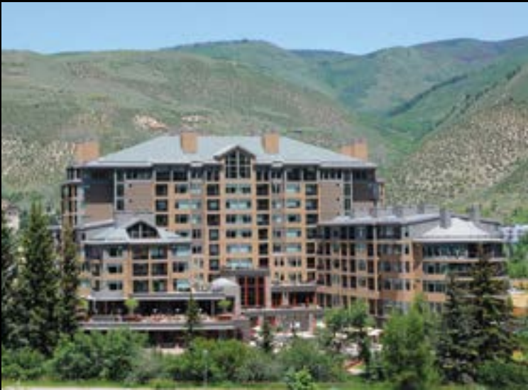
WESTIN RIVERFRONT #235 AVON

A beautiful 1.2 acre duplex homesite in Wildridge. There are few lots left in the entire Vail Valley like this one! Set against BLM land, this site feels much larger than it really is. Located steps from a pocket park & across the street from June Creek forest access road, this is a prime lot just minutes to Avon, Beaver Creek, & Vail. $395,000