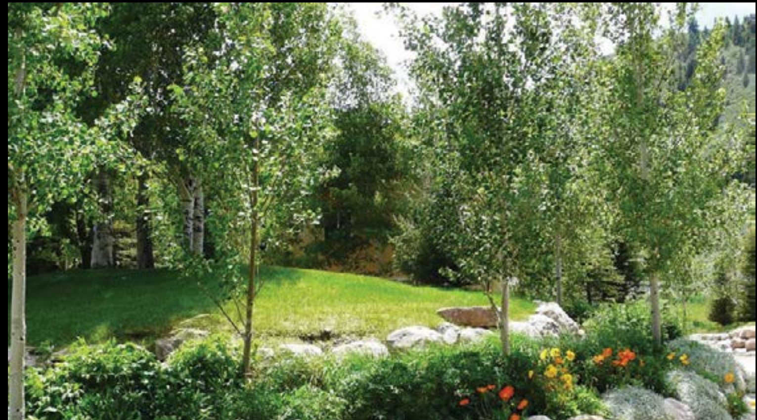
32270 US HIGHWAY SIX EDWARDS

Set upon the glorious Eagle River, distinguished by its congenial entertainment hub that is just minutes from Vail, Beaver Creek & the Eagle Airport, the town of Edwards is truly a mountain gem. Founded in the late 1800s, Edwards has retained much of its Old West charm, yet has evolved into a chic community that is the fastest growing in Eagle County. Celebrating award-winning restaurants, quaint shops, boutiques, expansive parks & endless trails, this community has become an epicenter of its own.