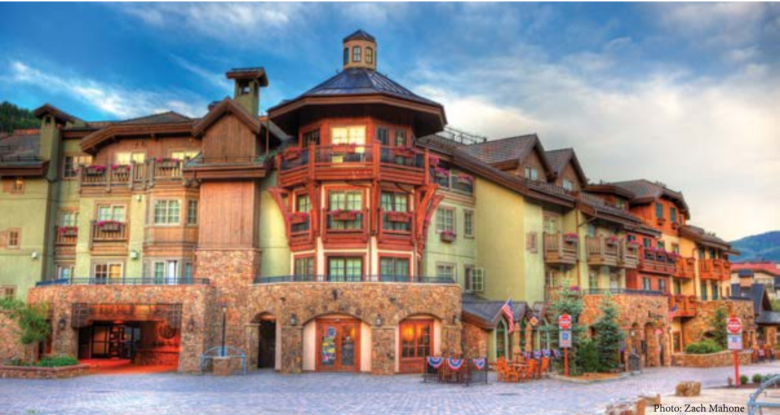
ONE WILLOW BRIDGE ROAD FRACTIONALS

Set in the heart of the Vail Village, this is one of Vail’s most celebrated buildings. Five-star amenities include valet, concierge, infinity pool overlooking Gore Creek, hot tubs, beautifully appointed common areas, spa & fitness center.