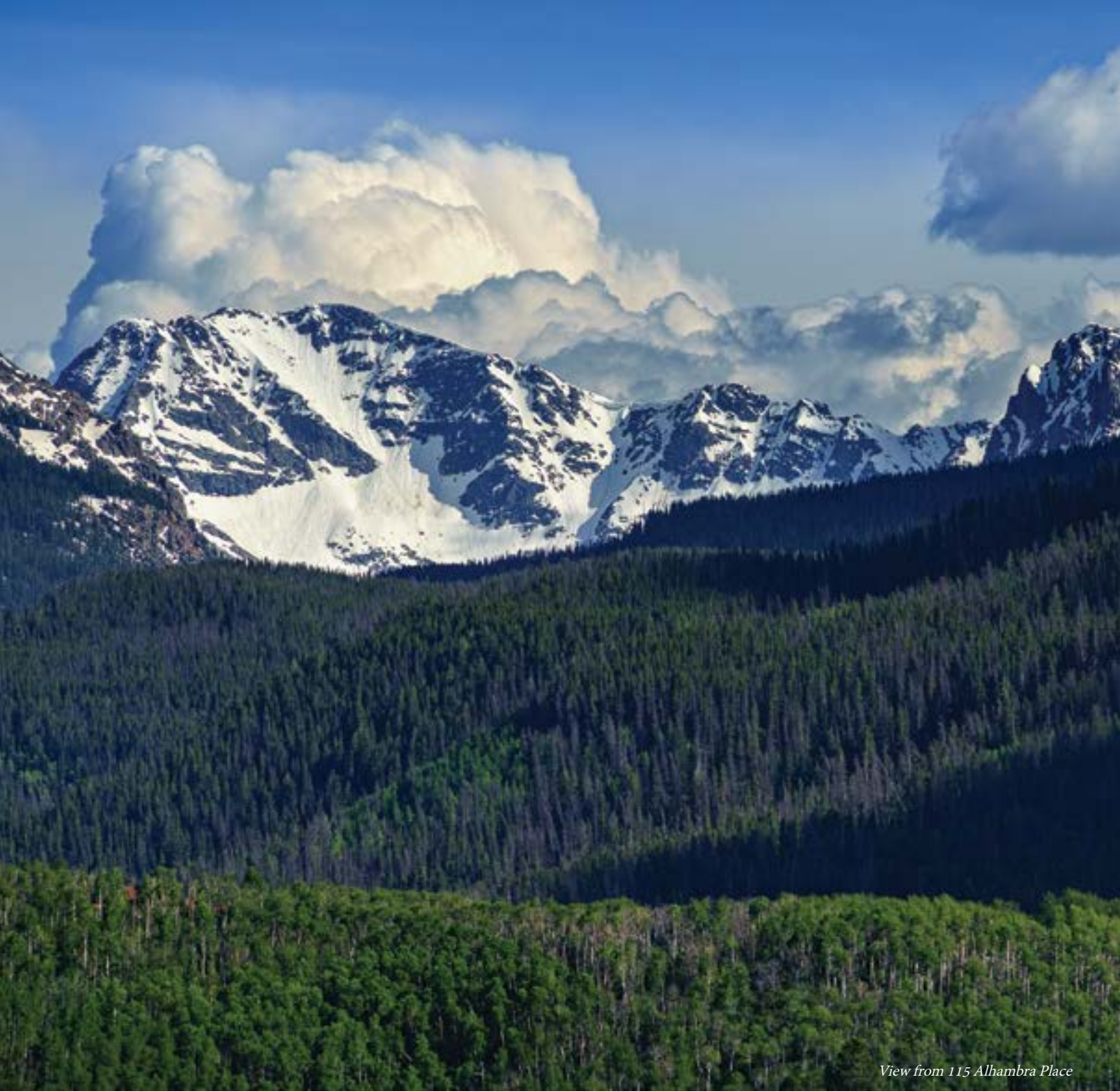
View from 115 Alhambra Place