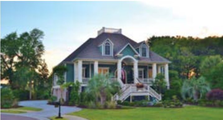
South Carolina 5 Beds, 5,308sqft $1,275,000