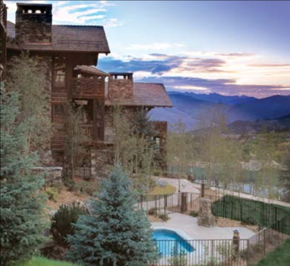
SETTLERS LODGE #203

Enjoy ski slope views from this sunny, south-facing 1,786 sqft condo in the heart of Bachelor Gulch. 3 bedrooms & 3.5 bathrooms complement the great room which boasts hardwood floors & a stone fireplace. A large deck overlooks the park & the ski runs, affording you great views, afternoon sun & gorgeous sunsets! A hot tub, underground parking garage, large ski storage room with locker & elevator access to the condo. $1,395,000 furnished.