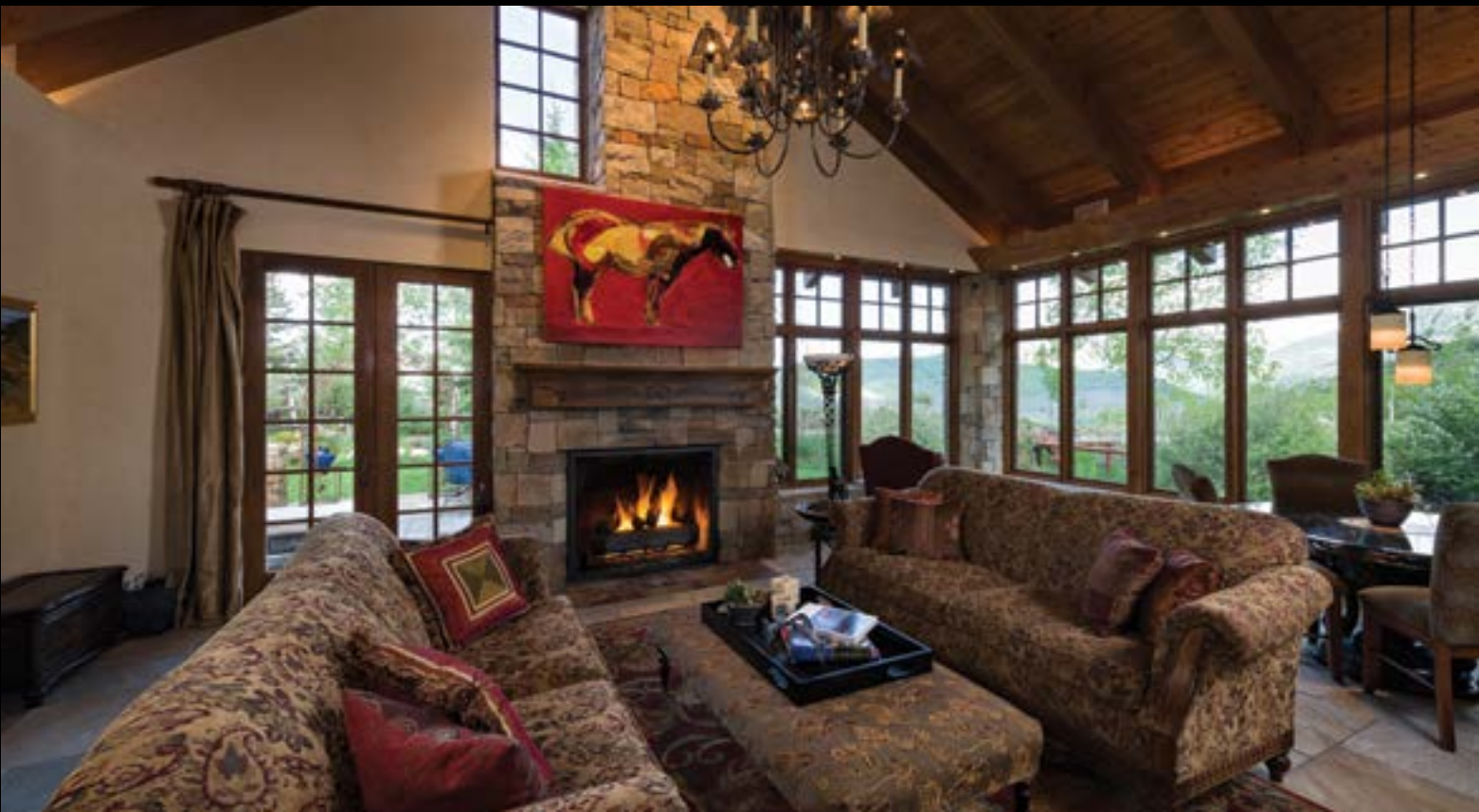
382 EL MIRADOR ROAD THE DIVIDE AT CORDILLERA

This gorgeous 6 bedroom, 6.5 bathroom, 9,347 sqft home exudes European elegance with unmatched finishes & decor. Situated on a private, 2 acre site, this stunner offers breathtaking vistas from every room. A rare wood burning fireplace in the living room is flanked by grand windows capturing Gore Range views. The spacious gourmet kitchen has top-of-the-line appliances & a huge, slab granite island. Colorado outdoors is experienced here with heated stone terraces, fireplace with pizza oven, hot tub & expansive lawns. $3,600,000