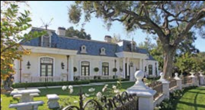
La Canada, California 7 Beds, 8,005sqft $6,750,000