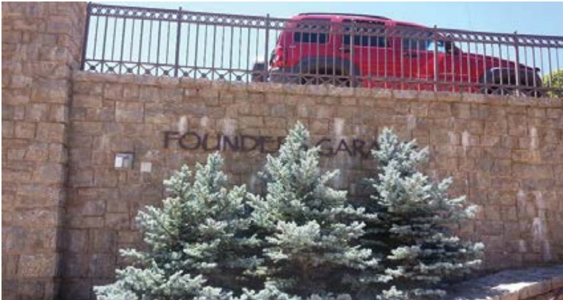
360 GORE CREEK DRIVE FOUNDER’S GARAGE SPACE

2 bed/2 bath, 1,600 sqft with top-of-the-line finishes & mountain views. 7 weeks/year plus unlimited use on space available basis. Starting at $390,000