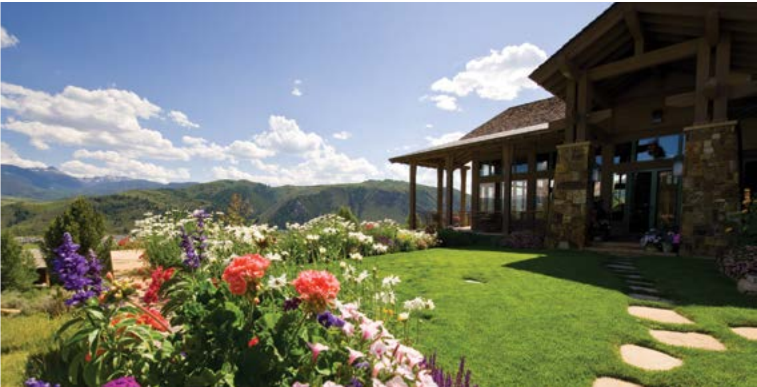
81 ELK RUN COURT CORDILLERA VALLEY CLUB

Located on a private cul-de-sac this exquisite home is Cordillera Valley Club's premier property. Nestled on a gorgeous hillside overlooking the 7th & 8th fairways of Fazio's golf course, this 7,713 sqft residence captures 180 degrees of dramatic, sweeping views from massive banks of windows. Feasting on the New York Mountain Range, the dramatic great room showcases a striking stone fireplace & wood ceiling with copper accents & soaring walls of glass. The glamorous master suite is graced with bright, towering windows that frame magnificent Colorado panoramas. Boasting a fireplace, breakfast bar & private stone patio with hot tub, this wing is the ultimate master haven. The 5 sumptuous junior suites echo the perfection found in the master suite, enjoying view-filled windows, private verandas & expansive baths. Huge reduction to $2,900,000