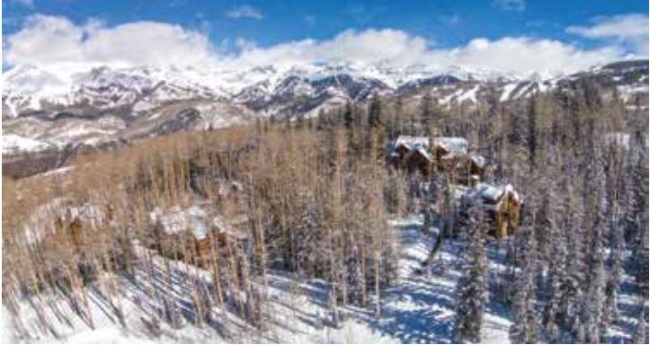
Telluride, Colorado 8 Beds, 10 Baths $7,950,000