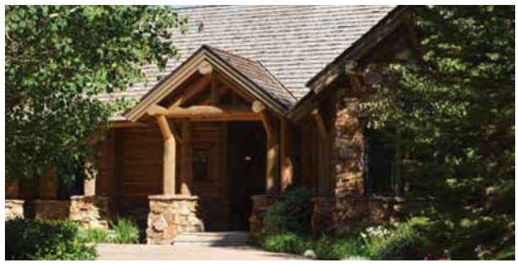
Cordillera Ranch 4 Beds, 6,395sqft $2,578,500 Listed by Gateway