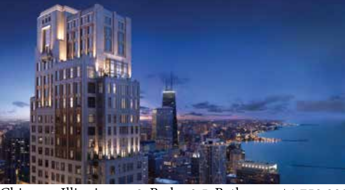
Chicago, Illinois 3 Beds, 3.5 Baths $4,750,000