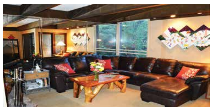
Vail 3 Beds, 933sqft Listed by Gateway