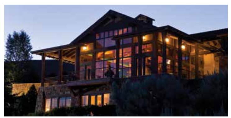
Cordillera Valley 6 Beds, 7,732sqft $2,600,000 Listed by Gateway