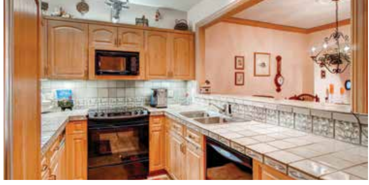
Beaver Creek 2 Beds, 1,431sqft $720,000 Listed by Gateway