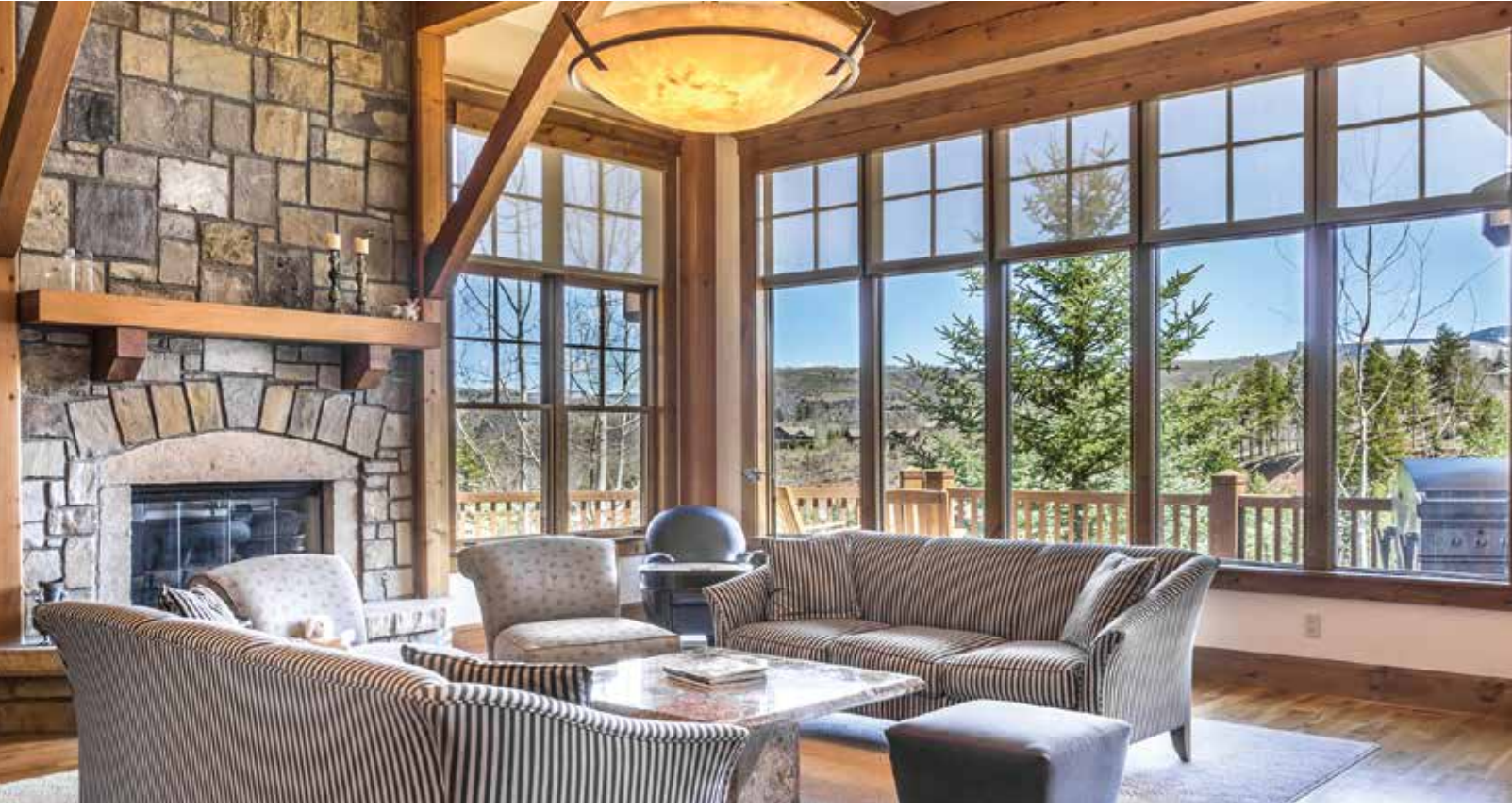
38 GREY HAWK LANE The Ranch at Cordillera 5 BEDROOMS, 5.5 BATHROOMS, 5,368 SQFT $1,795,000

Open and airy with clean, contemporary lines this gorgeous home is a short stroll to Gatehouse, golf & TimberHearth Grille. On a premium and private site, this stunner has 13-foot ceilings and grand views from 30-foot bank of windows. Enjoy breathtaking vistas of the Gore Peaks, Sawatch Range, The Red & White Mountains and south to the Course from the wrap-around deck offering both shade and sun. Main-level living is at its best with a handsome great room, study and master bedroom suite. The walk-out lower level offers a huge family room with fireplace.