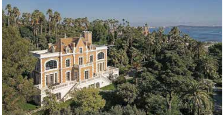
Cannes, France 9 Beds, 9 Baths Call for Pricing