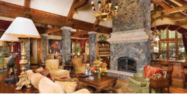
Arrowhead 6 Bedrooms, 8,212sqft $6,600,000 Sold by Gateway