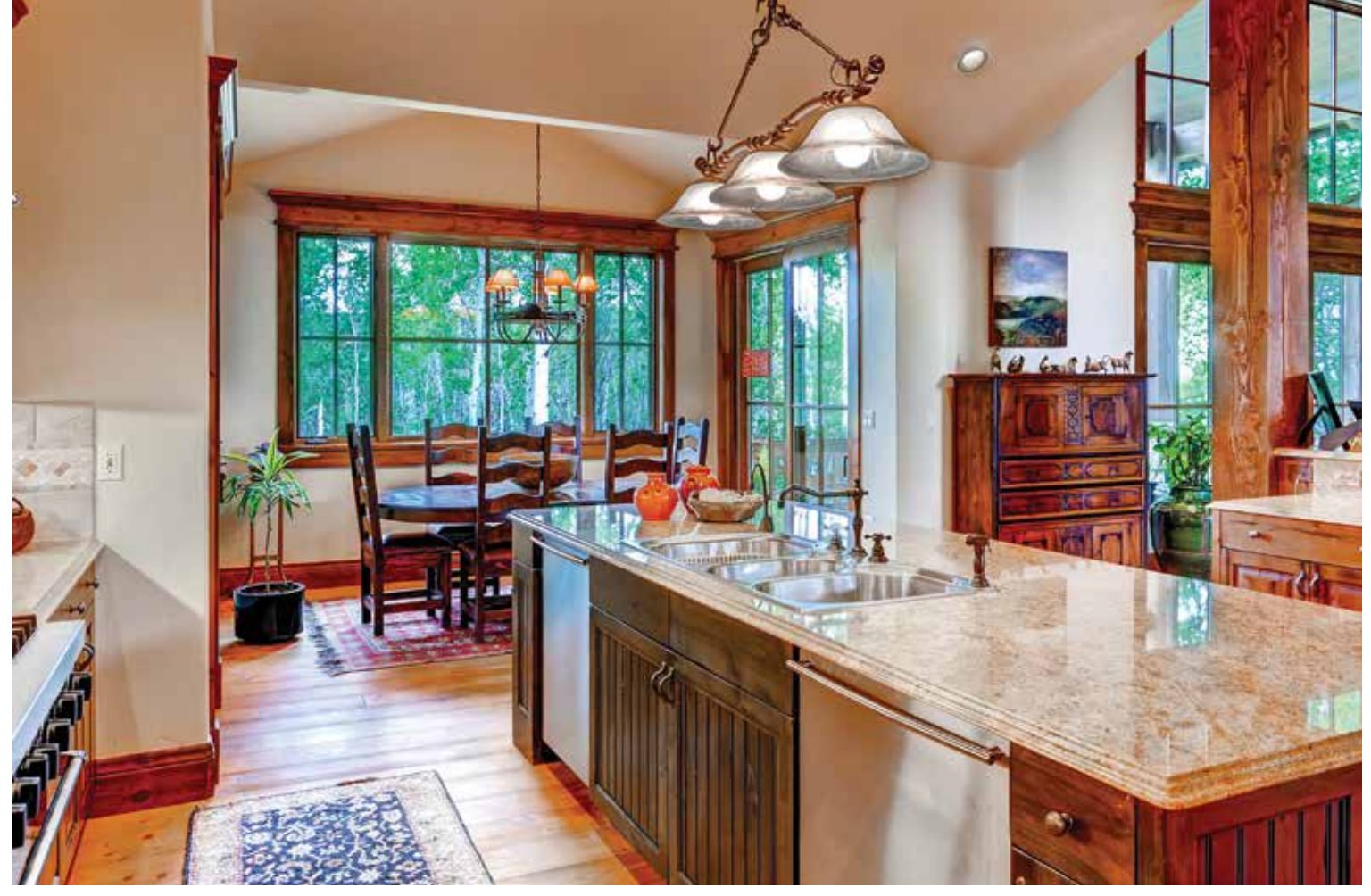
2486 FENNO DRIVE The Ranch 5 BEDROOMS, 5 FULL/2 HALF BATHROOMS, 6,458 SQFT $2,049,000

This stunning home overlooks the 3rd tee box of the Hale Irwin designed course. With beautiful finishes and a free flowing floor plan, the residence offers an expansive great room with floor-to-ceiling stone fireplace, gourmet kitchen with Viking appliances and slab marble counters. The main level master has vaulted ceilings and the caretakers suite is located over the 3-car garage. The walk-out lower level has 3 bedroom suites, a wet bar and media room.