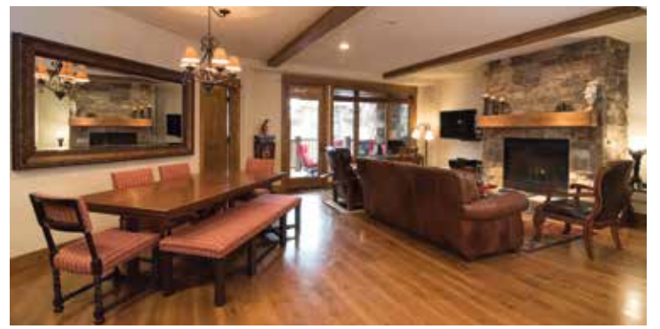
Arrowhead 2 Beds, 1,474sqft $1,100,000 Listed by Gateway

Select Properties Recently Sold by Gateway Land & Development Real Estate