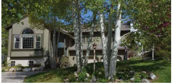
Edwards 5 Beds, 3,521sqft $905,000 Listed & Sold by Gateway

Cordillera Ranch 5 Beds, 5,298sqft $1,665,000 Listed by Gateway