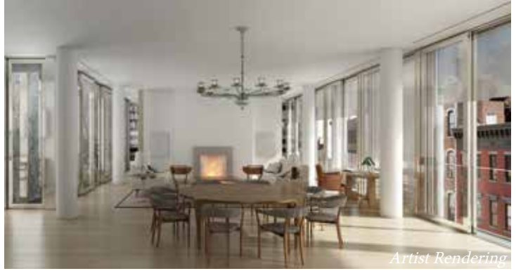
New York, New York 3 Beds, 4 Baths $9,950,000