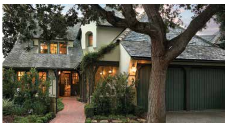
Santa Barbara, California 3 Beds, 3 Baths $3,950,000