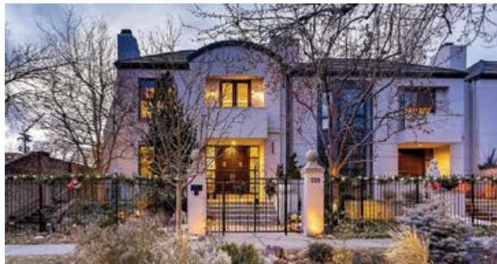
Denver, Colorado 3 Beds, 6 Baths $2,500,000