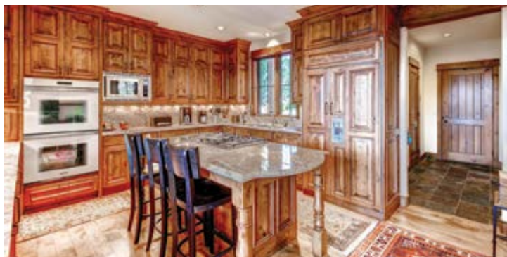
Cordillera Valley 5 Beds, 5,181sqft $1,740,000 Sold by Gateway