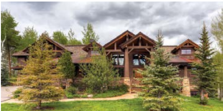
Cordillera Ranch 5 Beds, 6,458sqft $1,750,000 Listed by Gateway