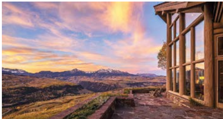
Telluride, Colorado 6 Beds, 5.5 Baths $7,950,000