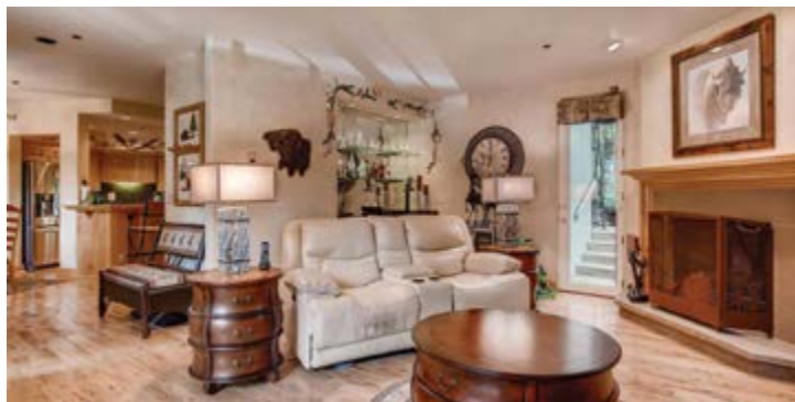
Arrowhead 2 Beds, 1,611sqft $750,000 Sold & Listed by Gateway