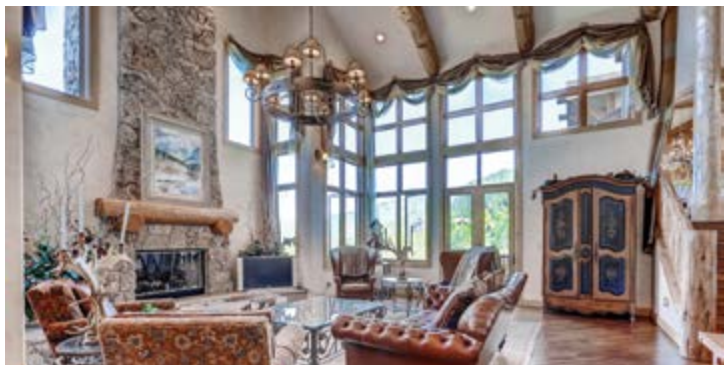
Arrowhead 6 Beds, 5,718sqft $2,833,875 Listed by Gateway

Select Properties Recently Sold by Gateway Land & Development Real Estate