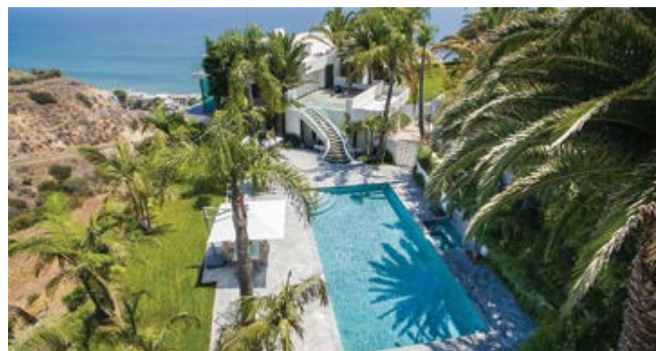
Malibu, California 5 Beds, 8,000sqft $17,500,000