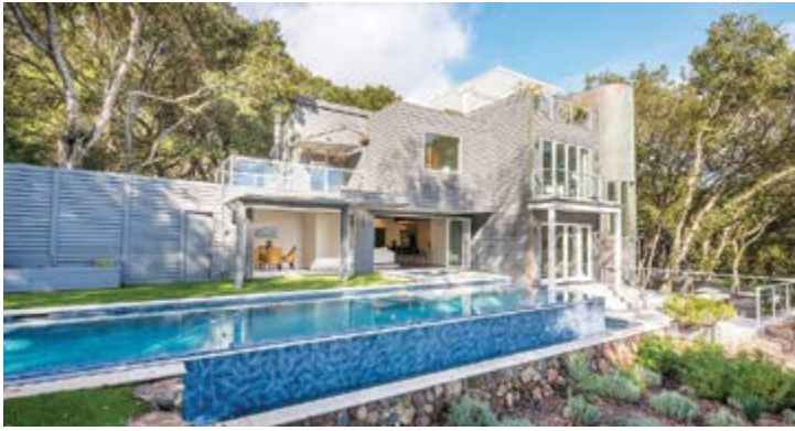
Sonoma, California 4 Beds, 5,000sqft $4,888,000