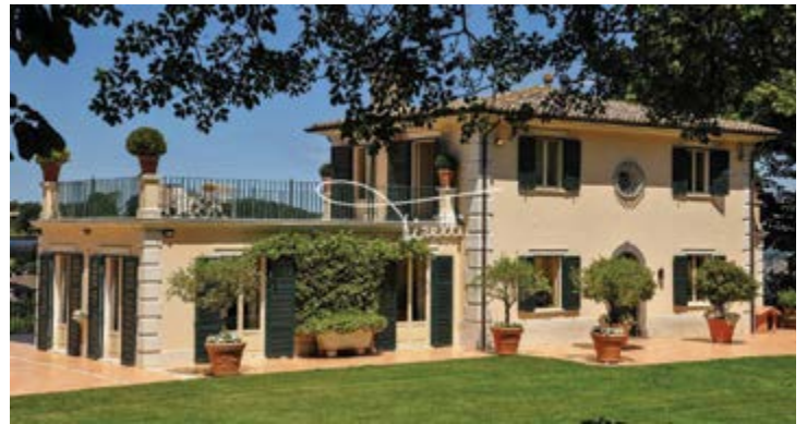
Orvieto, Italy 6 Beds, 7,664sqft $2,737,385