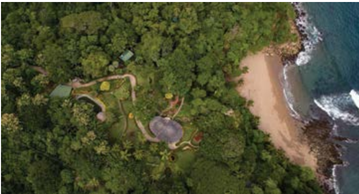
Costa Rica 4 structures, 3.5 acres $2,400,000