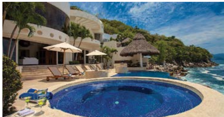
Puerto Vallarta, Mexico 5 Beds, 10,129sqft $2,299,000