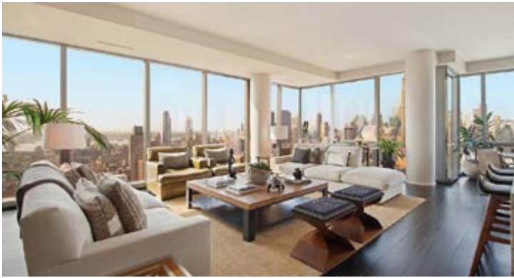
New York, New York 4 Beds, 3,310sqft $15,990,000