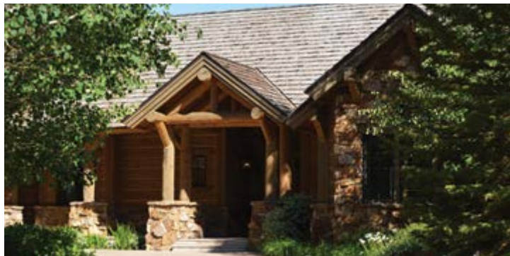
Cordillera Ranch 4 Beds, 6,395sqft $2,587,500 Listed by Gateway