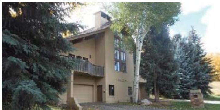
Beaver Creek 6 Beds, 6,793sqft $1,470,000 Listed & Sold by Gateway