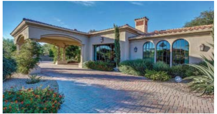
Scottsdale, Arizona 4 Beds, 5 acres $2,999,750