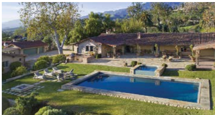
Santa Barbara, California 5 Beds, 5.7 acres $5,950,000