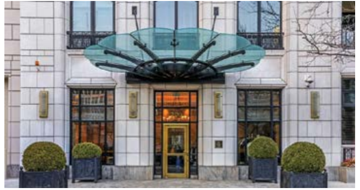
Chicago, Illinois 3 Beds, 3.5 Baths $3,625,000