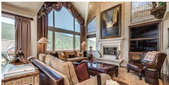
Beaver Creek 4 Beds, 3,217sqft $2,250,000 Listed by Gateway