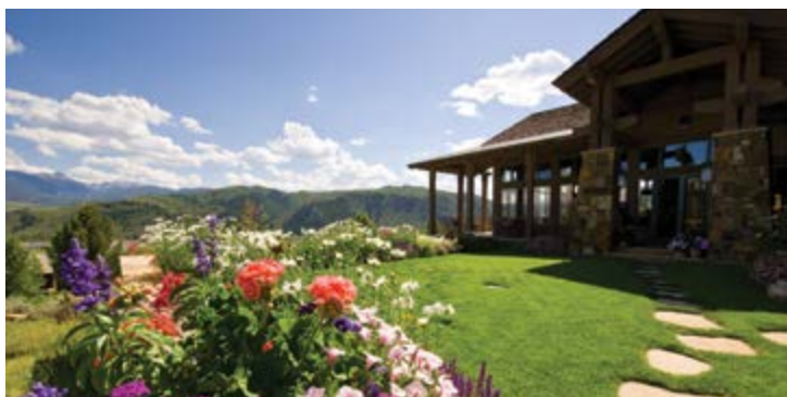
Cordillera Valley 6 Beds, 7,732sqft $2,600,000 Listed by Gateway