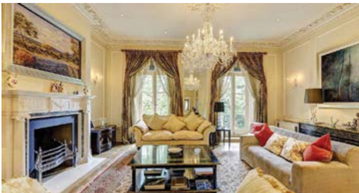
London, England 6 Beds, 8 Baths $29,903,252