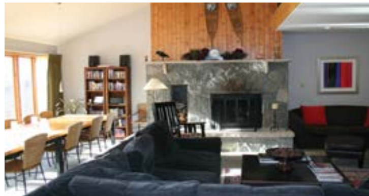
Vail 8 Bedroom, 7 Bathroom $1,550,000