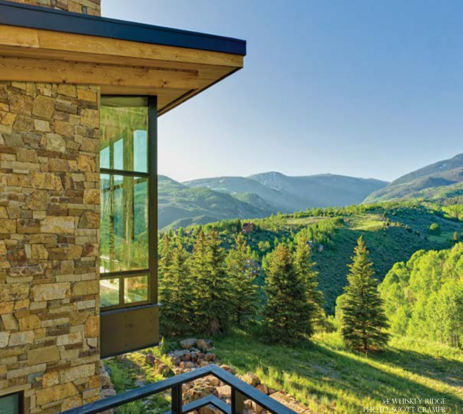
34 WHISKEY RIDGE