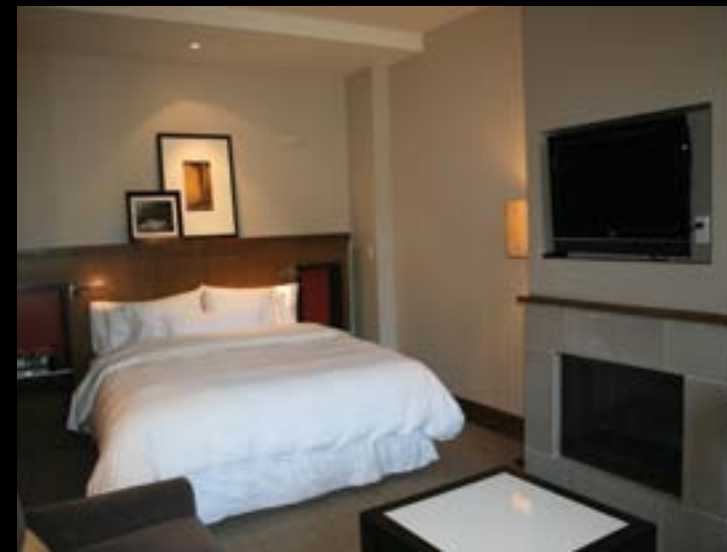
126 RIVERFRONT LANE #414 WESTIN RIVERFRONT

Rare Brookside Penthouse with vaulted ceilings & beautiful finishes throughout. This 3 bedroom, 4 bath, 2,572 sqft home has a gracious kitchen which opens to large great room with a floor-to-ceiling stone fireplace & deck that overlooks the Eagle River. The lovely master is conveniently located on the main level while a huge loft offers additional recreation & sleeping space. Enjoy the pool & work out room, fishing right outside your door, bike path adjacent & ski bus to Beaver Creek mountain across the street! $850,000