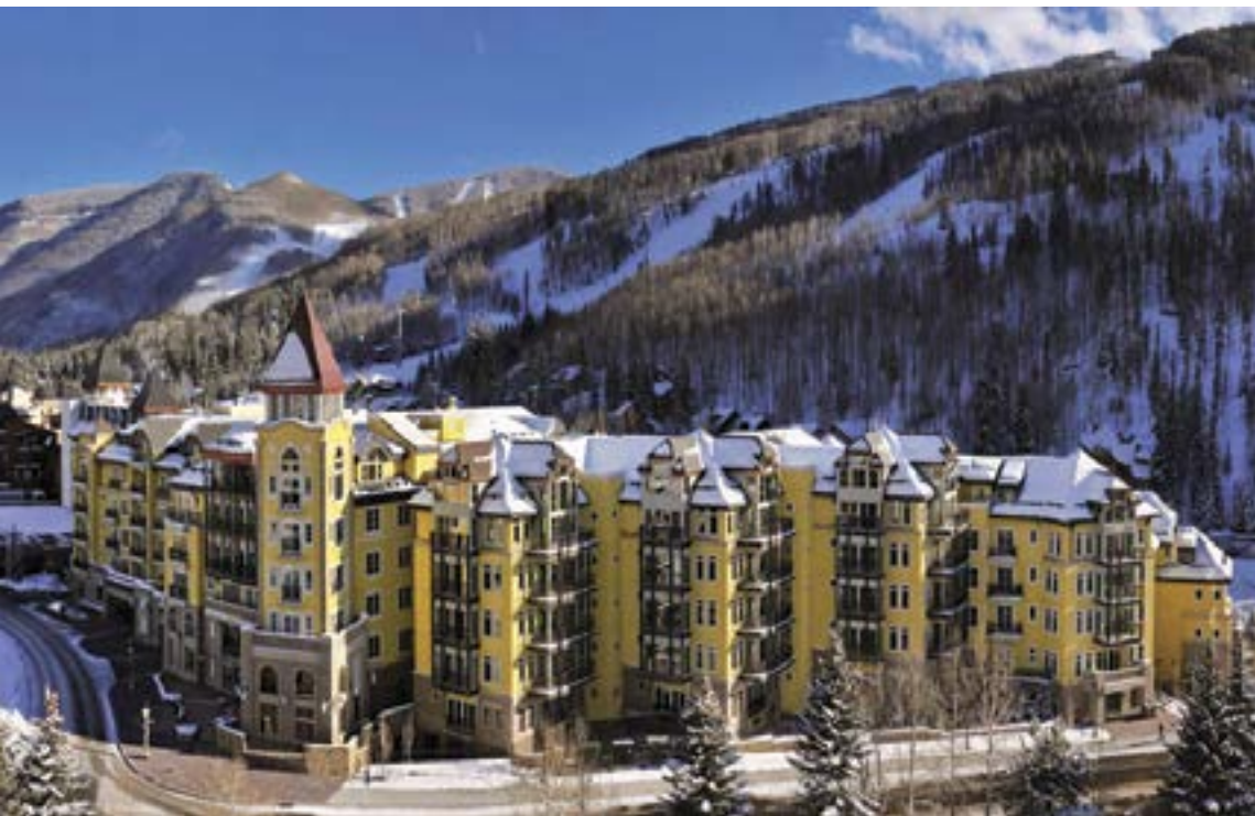
THE RITZ CARLTON RESIDENCES

The Solaris Residences may be Vail's finest Real Estate & offer exceptional amenities: an outdoor ice rink, public plaza, 3 movie theaters, shops, casual & fine dining, a 10 lane bowling alley, private swimming pool & hot tub, private spa & fitness facility, heated underground garage, valet parking & bell service. The residences feature the finest finishes & most advanced technology, as well as cathedral ceilings, air conditioning, & ski lockers at the lift & ski valet. Located in the center of Vail Village, Solaris is unmatched in style. Call for a personal tour!