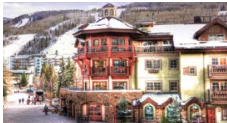
Vail Village 4 Bedroom, 4 Bathroom $6,300,000