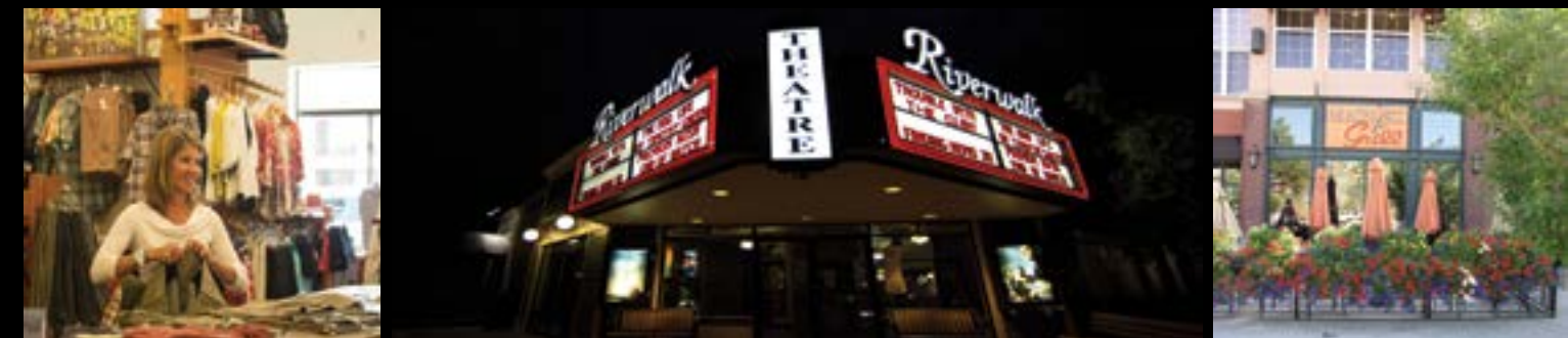
RIVERWALK AT EDWARDS FOR LEASE

OFFICE SPACE - This is the best office space deal in Edwards! Diamond Building G003 is a quiet & private 801 square foot unit on the Eagle River that has just been refinished & has a bathroom. $1,800/month all inclusive