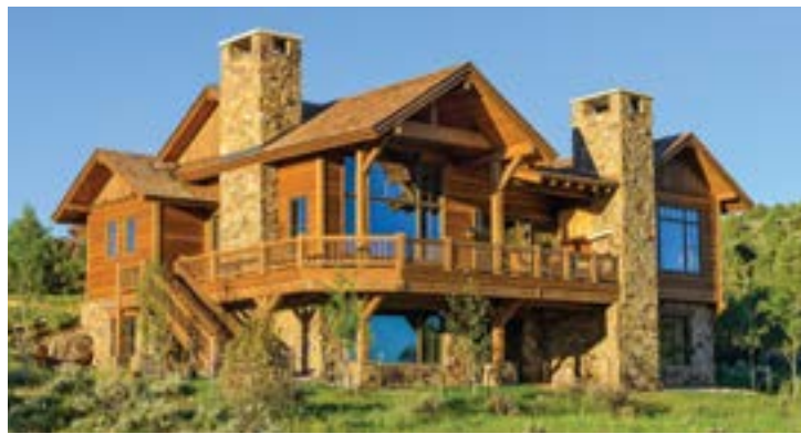
Red Sky Ranch 4 Bed, 5.5 Bath $1,545,000

Select Properties Recently Sold by Gateway Land & Development Real Estate