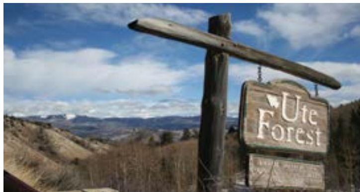
Colorow/Squaw Creek 35 acre ranch $400,000