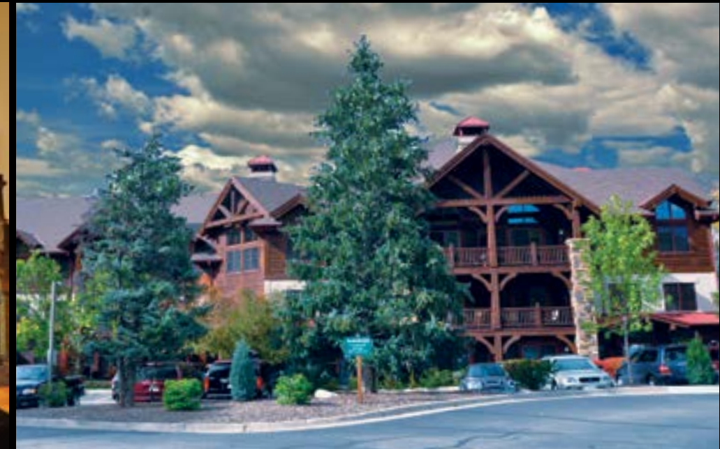
37247 US HIGHWAY SIX PENTHOUSE #309 BROOKSIDE PARK

Rare Brookside Penthouse with vaulted ceilings & beautiful finishes throughout. This 3 bedroom, 4 bath, 2,572 sqft home has a gracious kitchen which opens to large great room with a floor-to-ceiling stone fireplace & deck that overlooks the Eagle River. The lovely master is conveniently located on the main level while a huge loft offers additional recreation & sleeping space. Enjoy the pool & work out room, fishing right outside your door, bike path adjacent & ski bus to Beaver Creek mountain across the street! $850,000