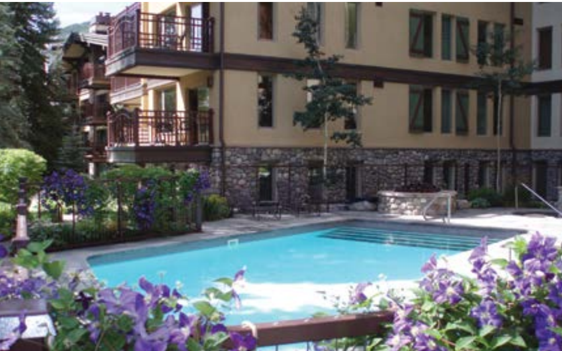
VAIL CORE #4

This intimate complex offers the utmost privacy & security with luxury ownership at only a fraction of the cost in one of the most exclusive developments in Vail. Two bedroom, two bathroom, 1,600 sqft with stunning Vail Mountain views & exceptional location on Gore Creek. Partial interest allows seven weeks per year plus unlimited use (on a space available basis with no additional charges.) Offers easy access to amenities that are too extensive to list! $465,000 furnished