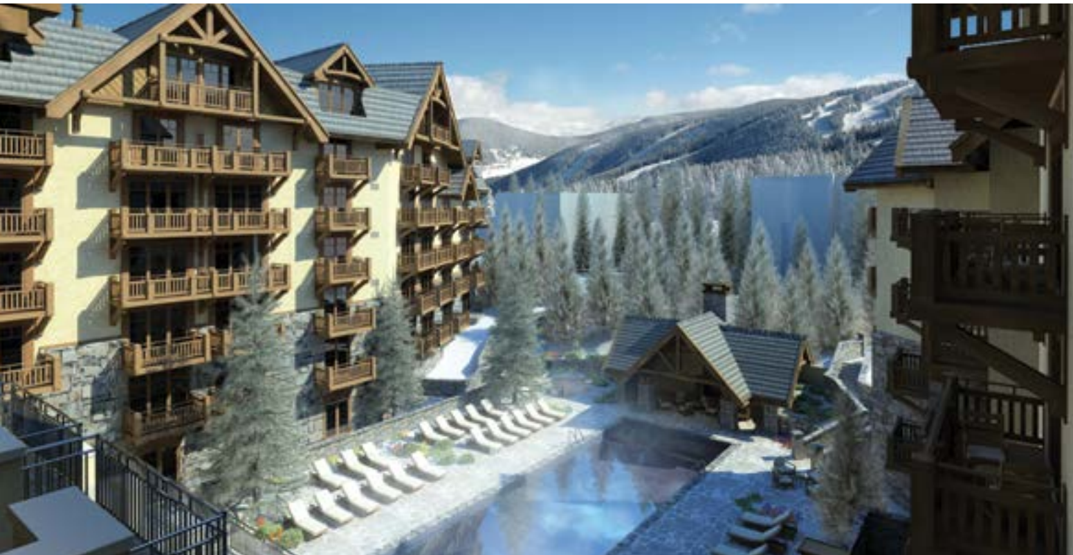
THE FOUR SEASONS

Residence Club owners have full access to Four Seasons Resort & Residences Vail amenities & services including: ski concierge at the base of Vail Mountain's Vista Bahn lift; spa, fitness center, 75-foot pool, fine dining restaurant, business center, child care, teen room, & 24 hour in room dining. Residence Club owners also enjoy pre-arrival services (grocery shopping, dinner & spa reservations, childcare & activities planning). Daily residence housekeeping & year-round private owner's storage. Call for opportunities!