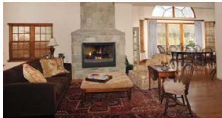
Homestead 5 Bedroom, 5 Bathroom $799,000