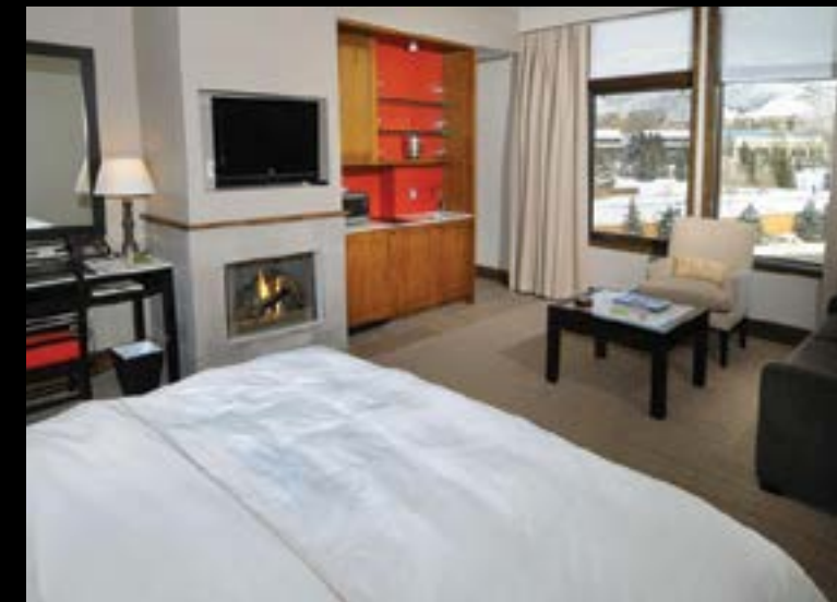
126 RIVERFRONT LANE #331 WESTIN RIVERFRONT

Wonderful opportunity to own at the celebrated Westin Resort rated #1 by Conde Nast Top 50 hotels in North America. This 463 sqft studio home features a preferred floor plan with kitchenette & private balcony. Amenities are endless & include a first-class fitness facility, salt water pool, three infinity hot tubs, & underground heated parking. Call for pricing.