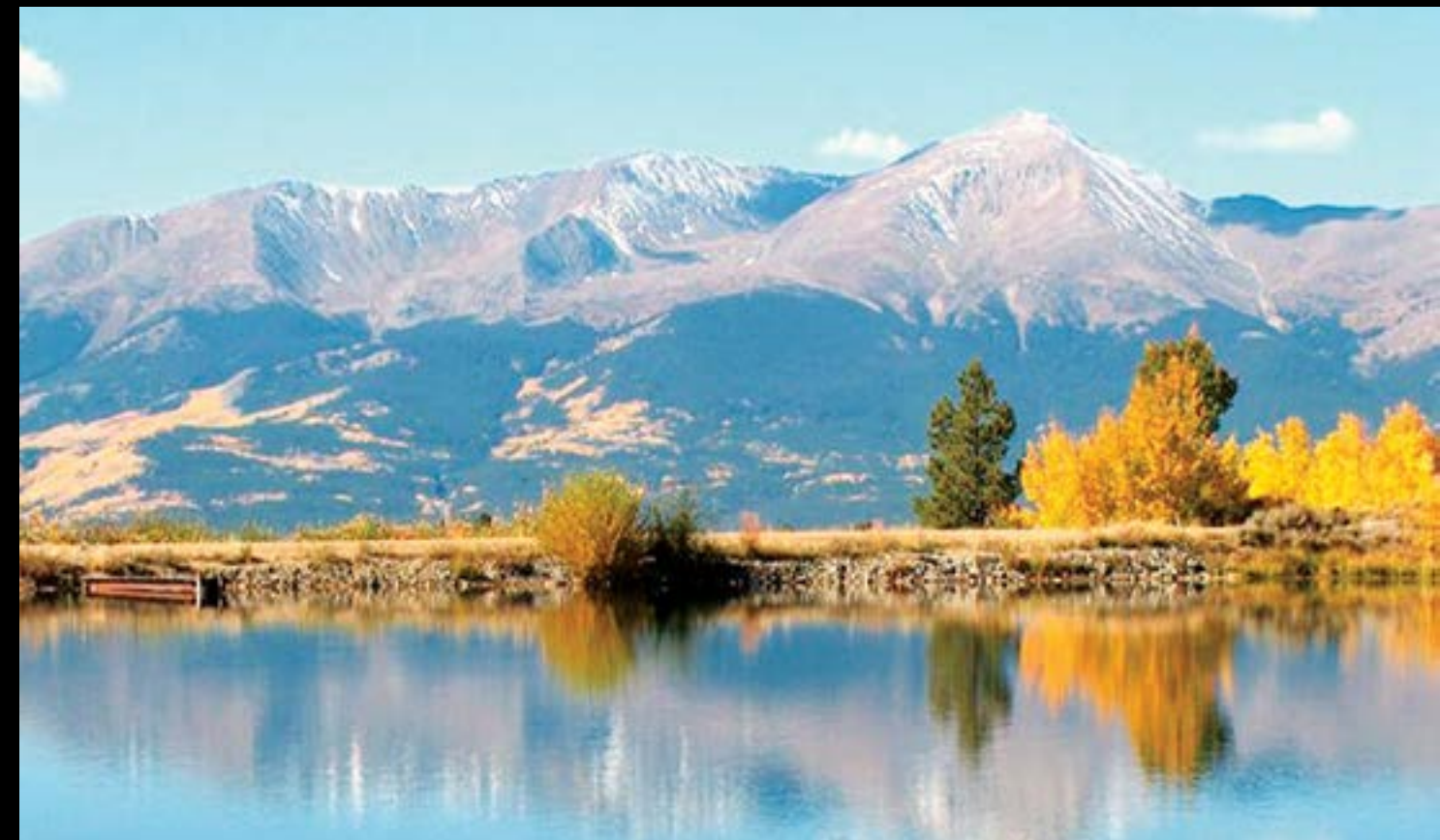
BEAVER LAKE ESTATE LEADVILLE

Beaver Lake Estate boasts private, buildable lots that are filled with Aspens & Pines with incredible views in every direction. Amenities include rental cabins, a horse corral & a clubhouse. Two private fishing lakes & RV hook-ups & campsites are conveniently close; a true rural, pristine escape unlike any other.