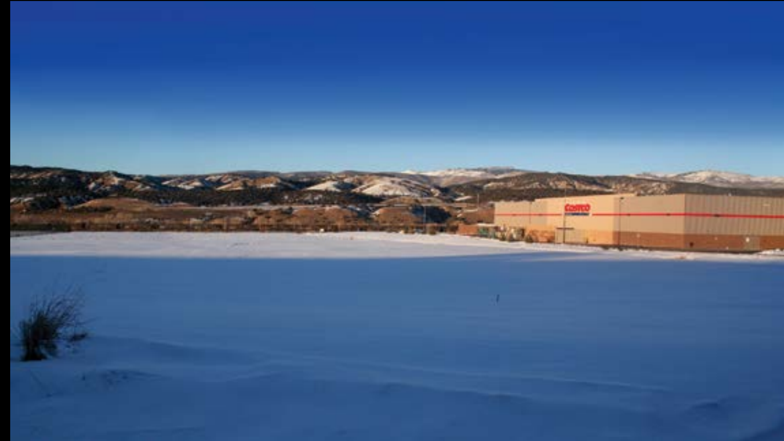
COOLEY MESA ROAD GATEWAY AIRPORT CENTER

These 3 lots, totaling 4.24 acres, are located on Cooley Mesa Road & have unparalleled, central location situated adjacent to the Costco in the Airport Gateway Center. These lots are primed for a successful business venture & are priced individually yet can be sold as one site.