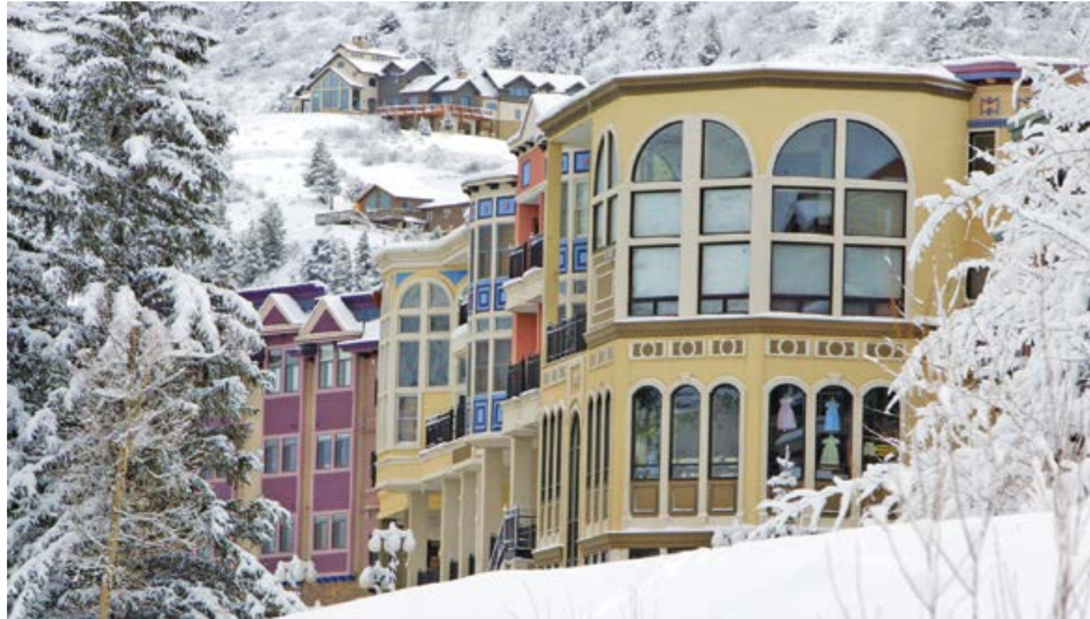
RIVERWALK AT EDWARDS FOR SALE

RETAIL SPACE - Quartz Building C106 offers 841 square feet of prime retail space directly across from Starbucks. The next door unit is also available. Owner will finance with great terms. $295,000 (also for lease)