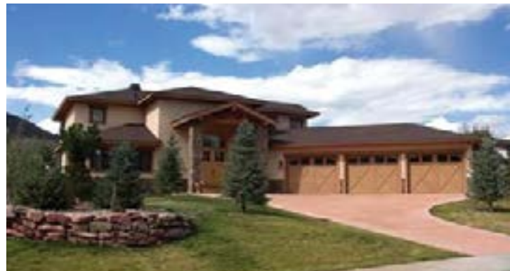
Cotton Ranch 5 Bedroom, 6 Bathroom $675,000