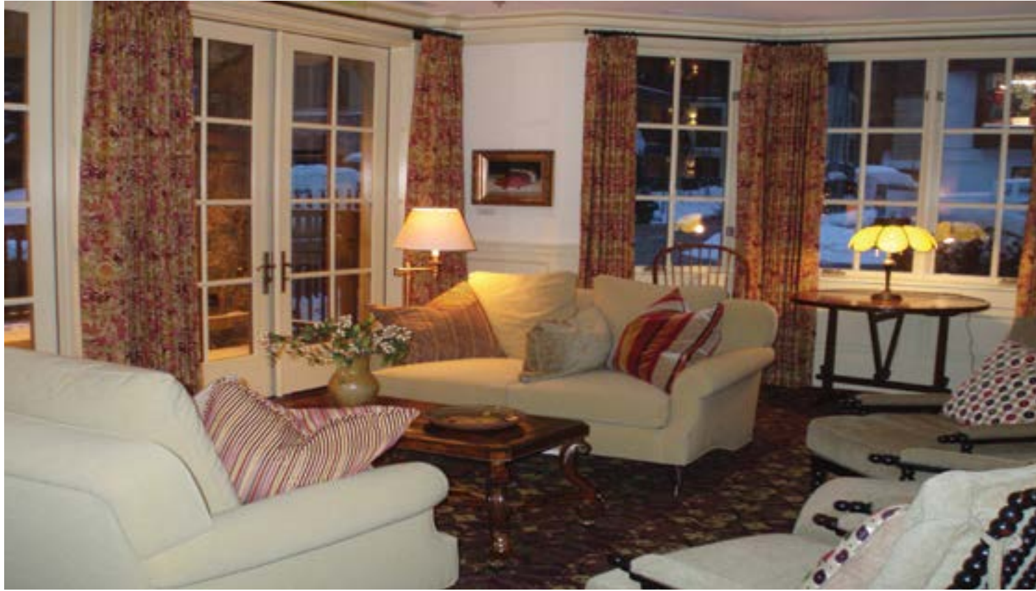
ONE WILLOW BRIDGE ROAD #301 FRACTIONAL

This intimate complex offers the utmost privacy & security with luxury ownership at only a fraction of the cost in one of the most exclusive developments in Vail. Two bedroom, two bathroom, 1,600 sqft with stunning Vail Mountain views & exceptional location on Gore Creek. Partial interest allows seven weeks per year plus unlimited use (on a space available basis with no additional charges.) Offers easy access to amenities that are too extensive to list! $465,000 furnished