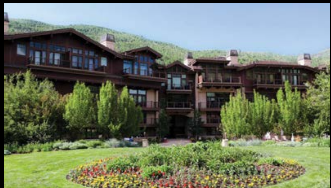
MANOR VAIL #267D

Fabulous one bedroom, 687 sqft residence walks out to Gore Creek! Private with a stream running in the background & forest all around. Steps to Gerald R. Ford Amphitheater & Betty Ford Alpine Gardens. In Vail Village, this is an A+ location across from Golden Peak & Chair 6, Riva Bahn Express. Front desk service, room service, spa, restaurant & lounge. 2 beautiful swimming pools & 2 hot tubs. Extravagant landscaping & remodeled Spa & Fitness Club. Prime location within Manor Vail! $699,000