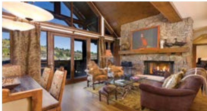
Bachelor Gulch 4 Bed, 4.5 Bath $1,825,000