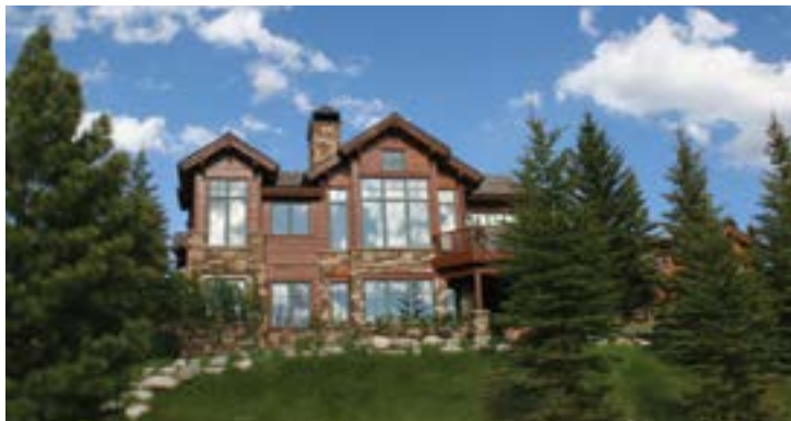
Cordillera Valley Club 5 Bed, 6 Bath $2,000,000